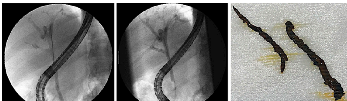
Fig. 3. Endoscopic retrograde cholangiopancreatography. Left – ERCP X-ray images after injection of contrast media, showing an ill-defined filling defect at the common hepatic duct bifurcation and irregular filling of intrahepatic bile ducts. Right – biliary casts that were retrieved from the common hepatic duct and left and right hepatic ducts, using an extraction balloon and a Dormia basket.