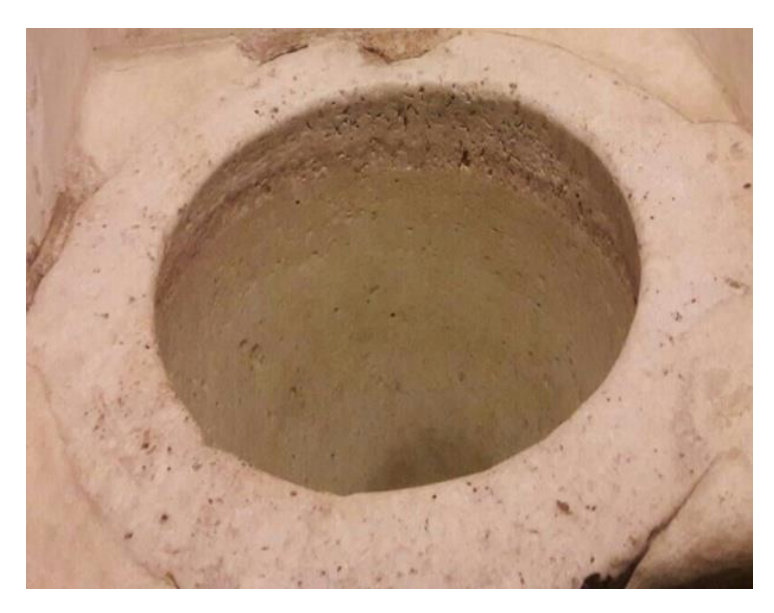
Fig. 5 – The small font in Dayr El Anba Bichay, stone, that dates back to the 4th century, 65 cm deep.

In ancient times, the large capitals of columns sometimes served as baptismal basins. A hole was made to clear the water after baptism. The splendid marble capital found in the Coptic Museum in Cairo provides a good example. It was discovered in the ruins of the Suspended Church of Saint Mark in Alexandria, which dates back to the 6<sup>th</sup> century. It takes the shape of a basket with reliefs of palm trees in the four corners<sup>43</sup>.