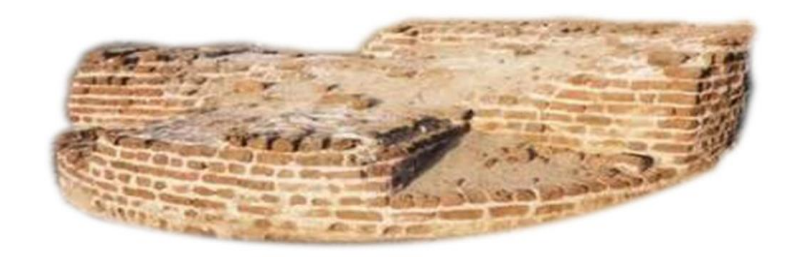
Fig. 3 - The cruciform baptismal font discovered near the western church in Pelusium, red brick stone, dates back to the 4<sup>th</sup> century.

5 - The cruciform shape that symbolizes the crucifixion of Christ, with stairs like the one in Pelusium (Al-Farama) (Fig. 3), discovered near the western church, dates back to the 4^{th} century. These remains exist actually in the north-western side, with a marble sailing and ruins of steps in the eastern and the western of the pool<sup>38</sup>.