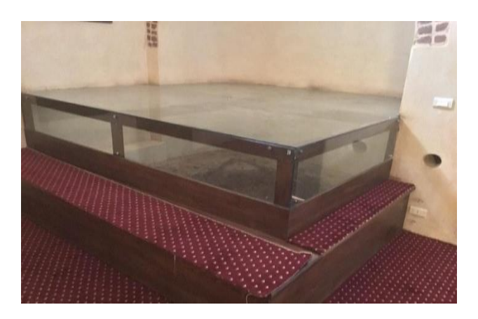
Fig. 14 - The Maghtas discovered in July 2017 in the church of the Virgin Sitt Miriam at El-Surian monastery, stone, 80 cm deep.

7 - Finally in July 2017, by undertaking extensions to the church of the Virgin Sitt Miriam at El-Surian monastery, accidentally a Maghtas was also discovered towards the western end glued to the wall, 80 cm deep, higher than the ground of the church of two bleachers because this Maghtas belonged to another church (the church of Mari- Ruta')<sup>86</sup> (Fig. 14).