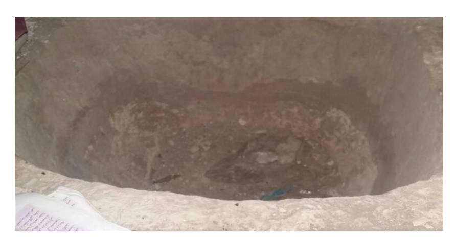
Fig. 7 - Squarefont in the Church of of Abu Seifein in Dayr Al-Maimoun at Atfih, limestone, 95 cm deep.

Dayr Al-Maimoun at Atfih embraces two baptismal fonts; one in the church of Saint Anthony placed in the left sanctuary in the shape of a circular limestone, the other is in the church of Abu Seifein a square shaped shallow stone used for children (Fig.7)<sup>49</sup>. Gothic graffiti of pilgrims with escutcheons decorate their walls<sup>50</sup>. The Wadamon El Armanty Church also contains a circular large hole for emptying the water<sup>51</sup>.