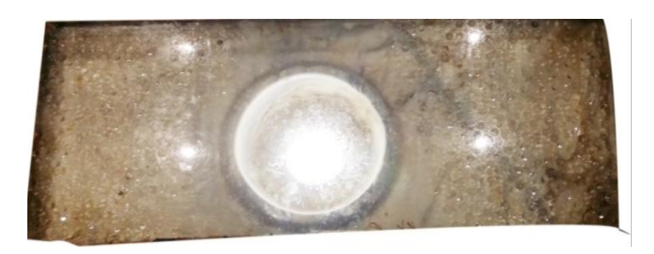
Fig. 10 - The laqân basin in Abu Sergah church in Old Cairo, marble, 15 cm deep.