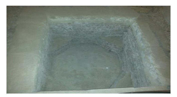
Fig. 13 - The octagon Maghtas , inscribed in a square in the palace of Saint Helena in the monastery of Saint Bishay, stone, 1.50 m deep.

5 - The palace of Saint Helena in the monastery of Saint Bishay (Deir El Ahmar), which is being restored, embraces the ancient monumental Maghtas of stone octagon form inscribed in a square. It was used previously by lay people and not monks<sup>84</sup> (Fig. 13).