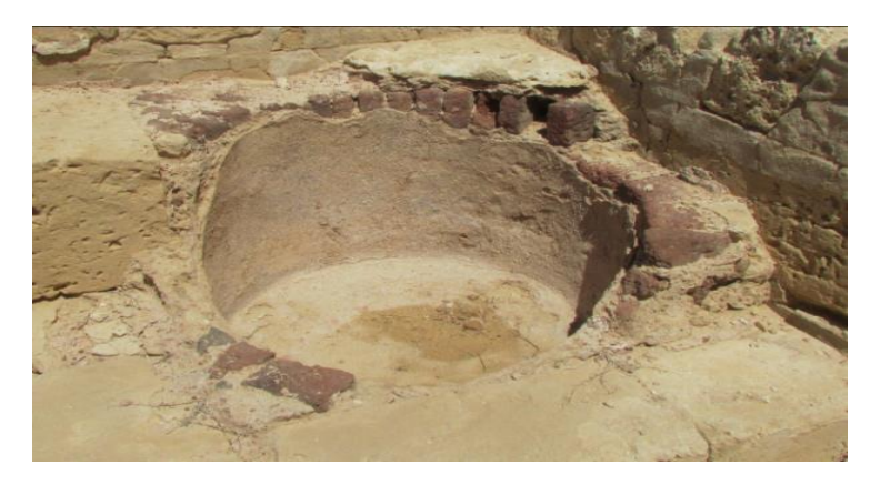
Fig. 1 – The circular baptismal basin inscribed in a rectangular in the north-eastern part of the temple church of Abusir, red brick stone, dates back to the 4<sup>th</sup> century.

4 - The cylindrical shape symbolizes the matrix: baptism is the second birth of the church matrix. It also symbolizes eternity: the circle is the infinity of God<sup>32</sup>. This is the most common form, with two steps to get down. There are many examples, such as: