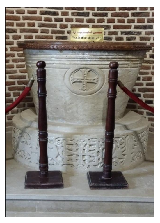
Fig. 2 – The cylindrical baptismal font, in the western of the narthex of Abu Sergah church, limestone, dates back to the 4<sup>th</sup> century.

Cylindrical forms without stairs appear in the Old Cairo churches as the one situated in the western of the narthex of Abu Sergah church<sup>36</sup> (Fig. 2), constructed in limestone sculpted in high relief with cross forms, with a pedestal decorated with crosses surrounded by birds and gazelles, placed inside a niche; it dates back to the 4^{th} century.