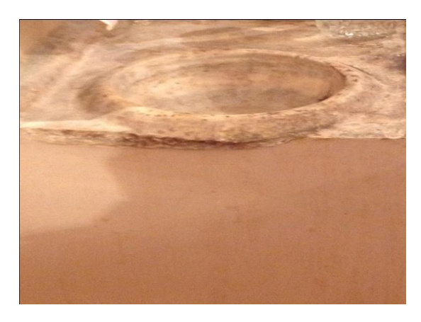
Fig.15 - The Pool of Extreme Unction in the church of Saint Abaskhirion El Qalini, Deir Abu Maqar in Wadi El Natroun, marble, dates back to 1395.