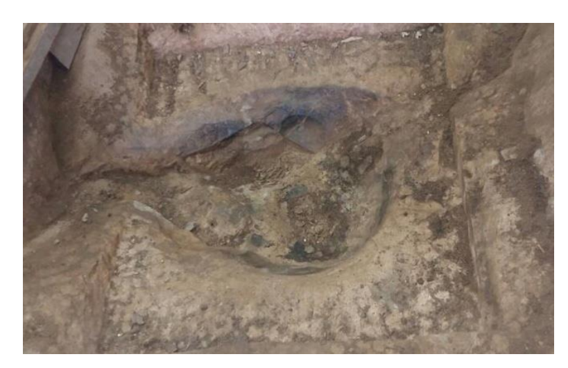
Fig. 9 - The stone laqân in the Abu Seifein church at Dayr of El-Maimum, in a bad situation.