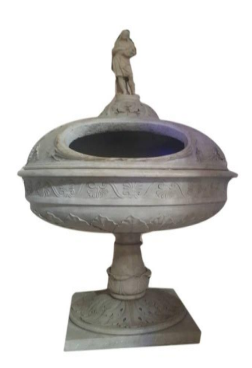
Fig. 6 - The marble font in the Church of Saint Catherine in Alexandria, this dates back to the 18^{th} / 19^{th} century.

A different type of baptismal font exists in Catholic churches known as the "chalice cup" where the practice of baptism is by aspersion. This font is built of marble and is adorned with different motifs<sup>46</sup>, such as that which appears in the font of the Church of Saint Catherine in Alexandria, which dates back to the 18<sup>th</sup>/ 19<sup>th</sup> century and is decorated by the statue of Christ, surrounded by high relief motifs<sup>47</sup> (Fig. 6).