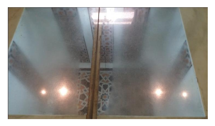
Fig. 11 - The rectangular Maghtas covered with marble in the Abu Sergah church, black and red marble, 1.40 m deep, 2.60 x 1.7 m length and width.

the central nave, 1.40 m deep (2.60 \times 1.7 \text{ m length and width})^{79} . It is in laid with black and red marble.