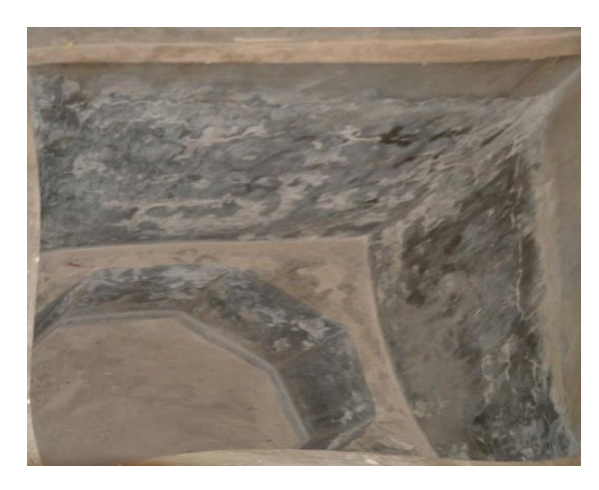
Fig. 12 - The octagonal Maghtas , inscribed in a square in the church of the Archangel Gabriel in Manfalout, stone, 2m x 2m length and width.

4 - In the west wall of a special room at Saint Anthony's Church in Deir El-Maimoun, there is a 2.60 \times 2.50 cubic stone Maghtas with two steps<sup>83</sup>.