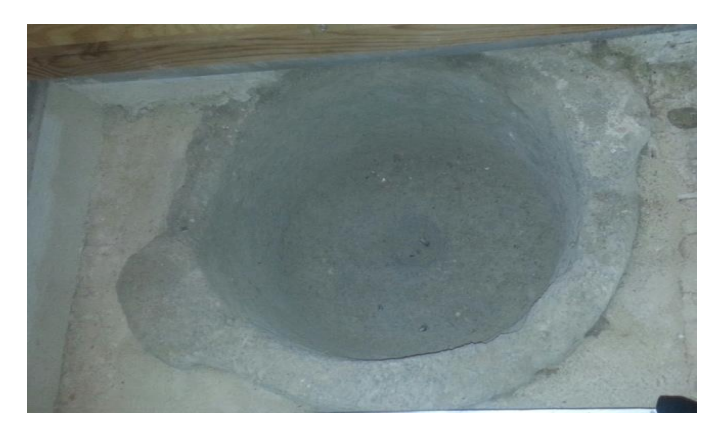
Fig. 8 - The stone basin, located at the entrance of the church of the AnbaBishay monastery in Sohag, 15 cm deep.

Butler asserted the existence of such basins. Indeed, a stone basin, below the level of pavement, devoted to washing, located at the entrance of the main church of the Anba Bishay monastery (The Red Convent) in Sohag, was discovered in 2017 (Fig. 8)<sup>63</sup>.