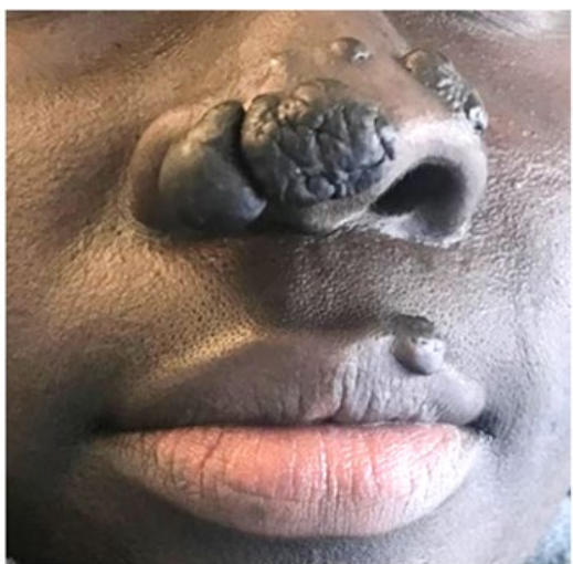
Figure 1: Left: At admission, multilobulated lesion of the nasal pyramid, with approximately eight centimeters, associated with a lesion of the upper lip, and local invasion of the skin. Right: Marked clinical improvement. After four weeks of HAART and two cycles of pegylated liposomal doxorubicin.

<sup>1</sup>Serviço de Medicina 2.5, Hospital de Santo António dos Capuchos, Centro Hospitalar Universitário de Lisboa Central, Lisboa, Portugal.