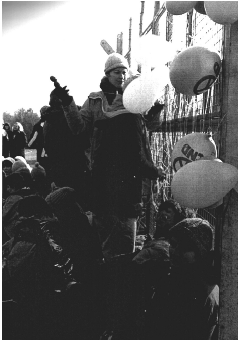
Torchlight anti-nuclear protest, Manchester city centre, 1984.