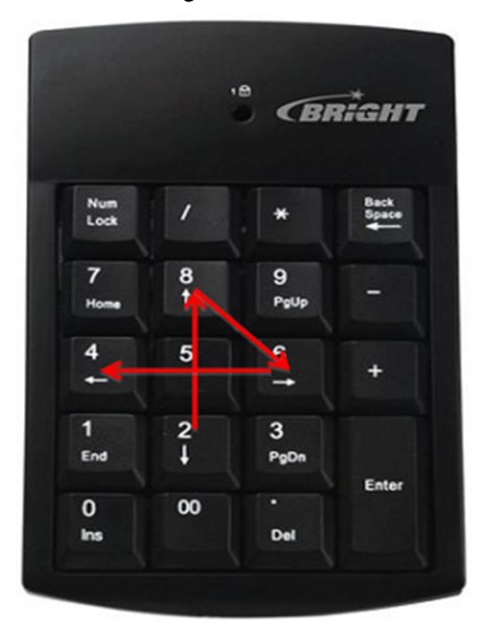
Figure 1 . Instrument used in the experiment, similar to Lai and Shea (1999).

Competition The aim of the task consisted of pressing the keys 2, 8, 6, 4 (in this specific sequence) using the index finger, under the target time of 850 ms and relative time of 22.2%; 44.4% e 33.3%, respectively. The relative time was adopted as structure measure and the total time as parameters measure, the same procedure adopted by Lage et al. (2007) and Lai & Shea (1999). In other words, volunteers should use 22.2% of total time (850 ms) to press from the key 2 to 4 and so on. The instrument consisted of one laptop, one screen, and one numerical keyboard (Figure 1) that were positioned over a table. Specific software was constructed for data collection and storage.