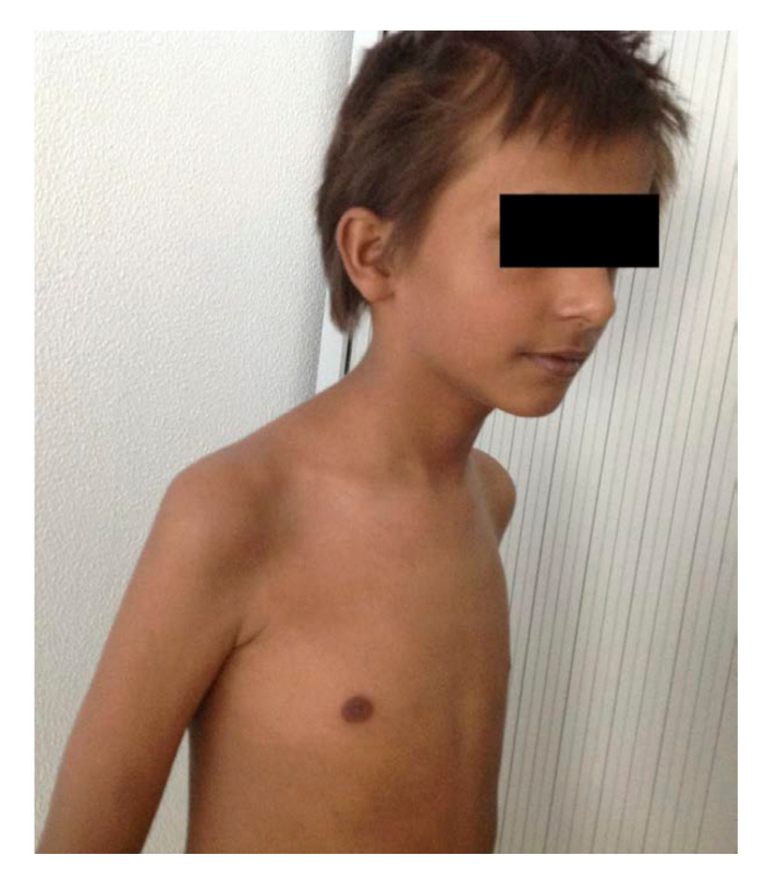
Figure 1 - Skin, oral mucosa and nipples hyperpigmentation of the ALD patient

Examination findings revealed adynamia and generalized skin hyperpigmentation, oral mucosa, palmar creases, ungueal beds and nipples. (Figure 1 and 2) Growth parameters were normal for sex and age and the body mass index was in the fifth percentile. His blood pressure was within normal limits.