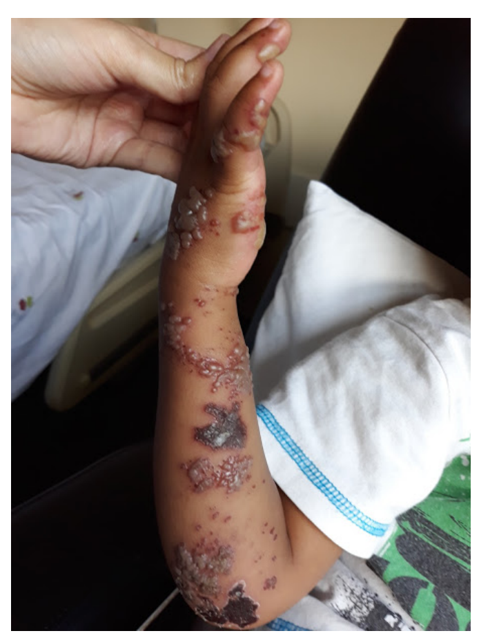
Figure 3 – Clinical improvement after six days of treatment with intravenous acyclovir

This case intends to alert for the differential diagnosis of vesicle and bullous eruptions. The location of lesions is unusual (with more frequent involvement of the torso and abdomen), as well as their exuberant presentation and extension. Although young age and absence of personal history of varicella (the mother denied varicella during pregnancy) or other exanthematic diseases in the past may be confounders, the hypothesis of zoster should always be considered in the presence of similar lesions. Serologic evaluation was not performed in this case, being assumed that it was a reactivation of a subclinical primoinfection.