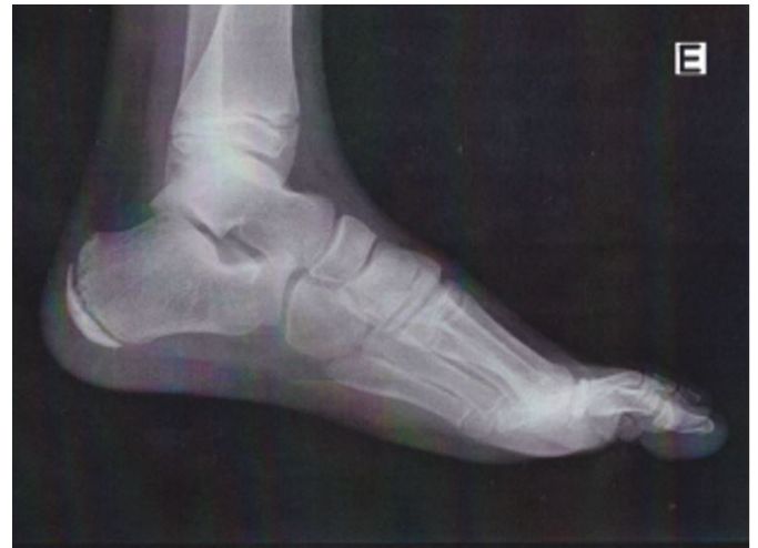
Figure 1 - Left foot radiograph showing mild sclerosis and irregularity of the calcaneal apophysis.

Significant improvement in symptoms and progressive normalization of gait were noted with treatment. Three weeks later, the patient reported no pain or limitations. He gradually resumed soccer training and had no relapses.