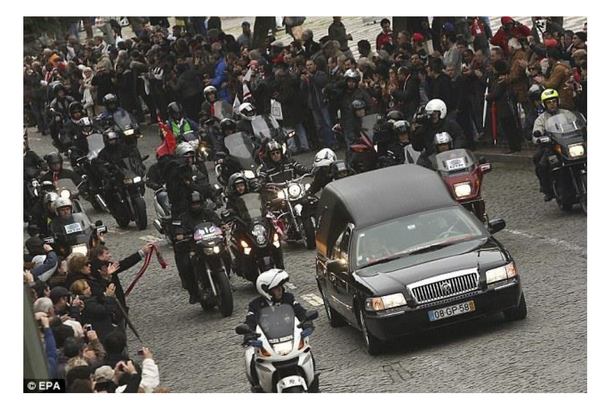
Figura 3. Media Cortege accompanying Eusébio's coffin.

Eusébio's funerary rites would not be the same without the assumed presence of media. These were media rituals on faithfulness. Hence, media rituals dealing with the technological dimension of media suggested the belief of media as fundamental providers of the exequies' sacred nature. It was almost as if the media presence, made Eusébio's funeral a master ceremony on collective life.