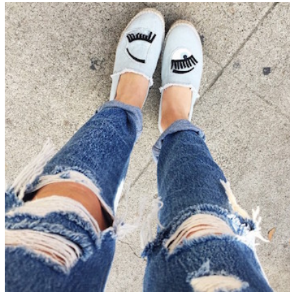
Image 6. Published on Instagram by Chiara Ferragni (12 January 2015)

Based on the results obtained, we have concluded that the most popular images amongst those analysed —the ones that received the most 'likes'— are those where you can see the blogger's full body against a significant background. The photo is taken with the camera at eye level angle and the predominant visual elements —either the young woman and/or the product— are placed at the centre. Additionally, the human figure stands out against the product, i.e., clothes and/or accessories. Warm colours are more widely used than other colours, as they transmit warmth and intimacy to the followers. Taking into account the former, it is consistent that users prefer themes where the blogger stands alone, as a model. Lastly, brands do not usually appear in an explicit manner in the photographs we analysed; that is, you cannot see a logo or brand name. However, this does not mean that followers do not know where the clothing in the images comes from, because complementary information is usually found in the descriptions of the photos or in the blog. Therefore, the image is used as a hook to lead the followers towards the complementary information that will allow them to purchase the clothing and accessories. We should also point out that the bloggers use their Instagram accounts for maintaining and promoting their influence. The reality is that these bloggers are personal brands in themselves and as such, they use visual composition elements to highlight their personalities.