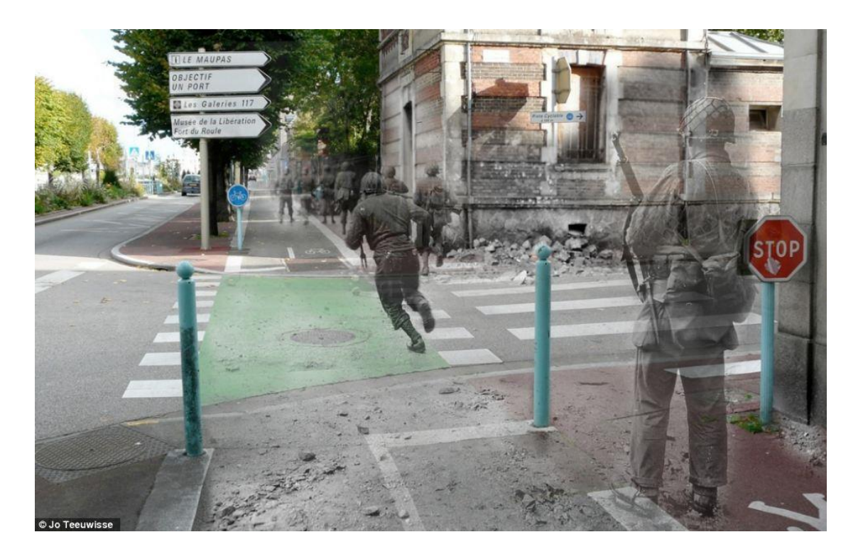
Figure 1. "Dangerous crossing: Soldiers race up Avenue de Paris in Cherbourg in 1944, speeding past the rubble and over modern-day road markings".