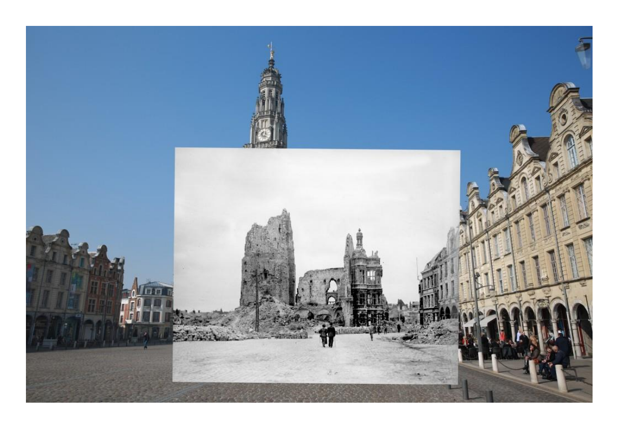
Figure 2. "The town hall and belfry of Arras, France is seen from the main square in this archive photo of destruction wrought during WWI."