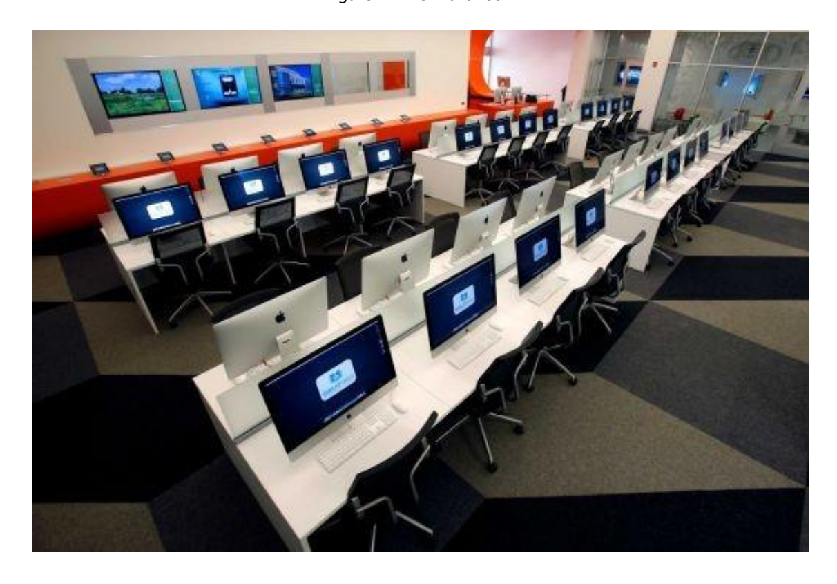
Figure 1. The BiblioTech.

akin to an Internet café than an actual library (Figure 1). The specific aim of the library — to bridge the digital divide between Bexar County's wealthier residents and its lower income (primarily Latino) households — is unsurprising in the context of what has come to be known as the "information age." More provocative, in the context of conventional ideas about what public libraries are and what they are for, is the BiblioTech's radical booklessness. For, while we are accustomed to the idea that part of what a library does is to facilitate literacy (including digital literacy), we are perhaps still not quite ready for the idea that a library can be a library without books. In this respect, the prospect of Bexar County's BiblioTech raises a much broader set of questions currently surrounding public libraries.