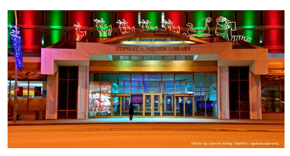
Figure 5. The Stanley A. Milner Library, Edmonton.