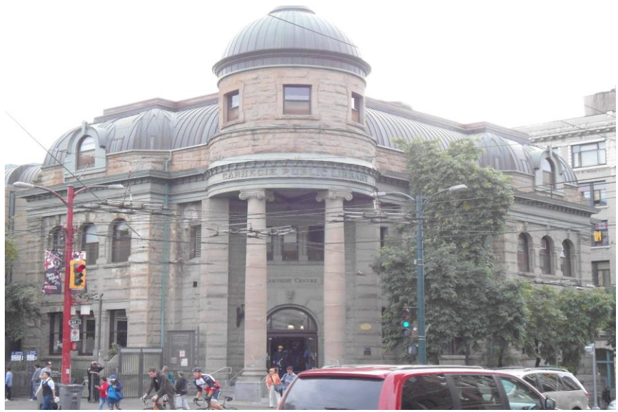
Figure 2. The Old Lady Sandstone, Vancouver's original Carnegie Library,