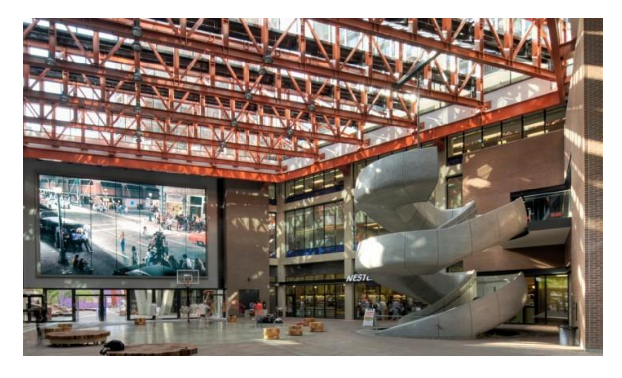
Figure 7. Woodward's Gallery.