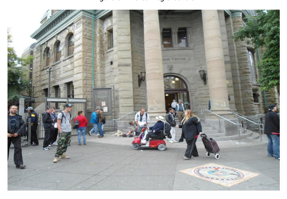
Figure 3. The Carnegie Centre.