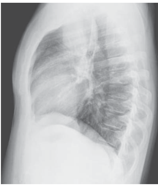
Figs. 1 and 2 – Chest radiograph showing a right-sided opacity in the anterior mediastinum

exam of his was inconclusive, revealing only mature B and T lymphocytes.