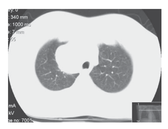
Fig. 3 – Thoracic computed tomography scan showing a paratracheal and pre-tracheal mediastinal mass, well-defined and with hydric content attenuation values