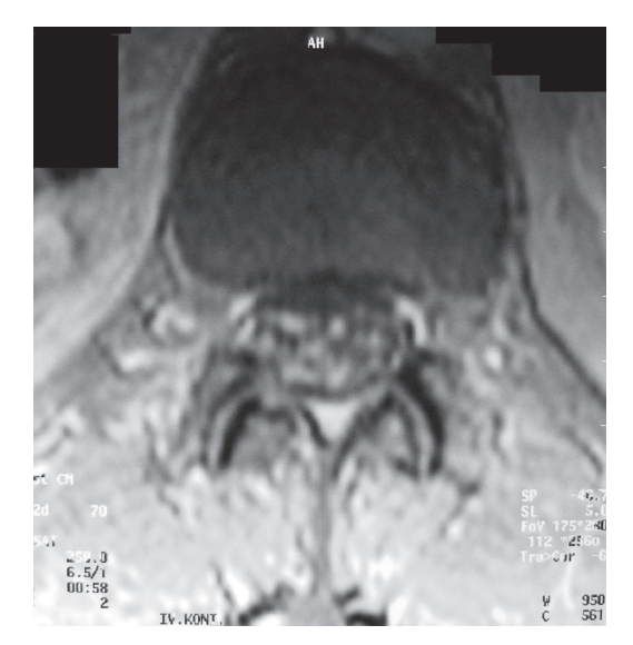
Fig. 2 – Transverse T1-weighted gadolinium-enhanced MRI scan at the L1-2 level. Enhancement of the cauda equina fibers in the thecal sac is seen

The tumor cells could reach the leptomeninges by several mechanisms: Arterial route (in patients with disseminated cancer, the leptomeninges are infiltrated through arachnoid vessels or choroid plexus); direct extension of the leptomeninges or seeding (primary CNS tumors), growing around and along peripheral nerves to the subarachnoid space (systemic tumors), iatrogenic (seeding of subarachnoid space during surgical extirpation of intraparenchymal metastases), entry to the subarachnoid space through the venous plexus of Batson and perivenous spread from adjacent bone marrow metastases. In most cases of breast or lung cancer pure leptomeningeal carcinomatosis is the result of cancer propagation from vertebral or paravertebral metastases<sup>1-4,9</sup>. New metastatic deposits along meningeal surfaces which invade subpial parenchyma, penetrate spinal nerve roots, and produce masses in the subarachnoid space.