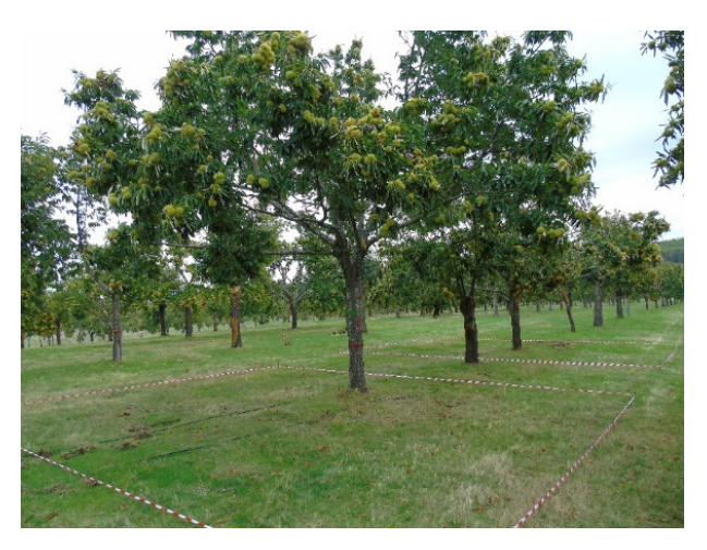
Figure 2 - Delimited area of harvesting below the trees canopy by a red stripe tape for determination of chestnut production per tree.

on the calibre and on the period of harvesting; being higher in the early and late seasons. The harvest of 'Judia' in the Trás-os-Montes region occurs during the mid-season.