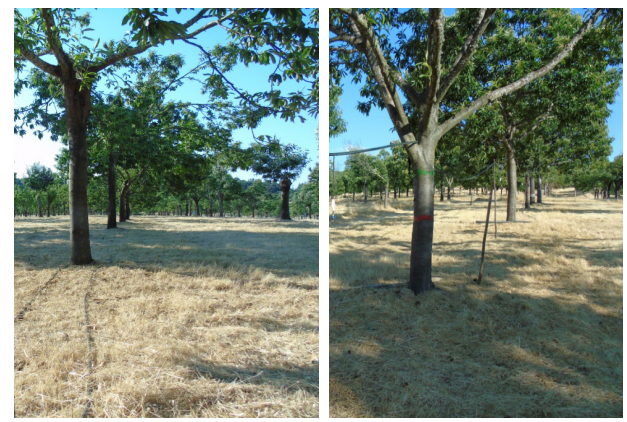
Figure 1 - Left: Drip system, two pipes per row of chestnut trees. Right: micro-sprinkler system with suspended pipe and inverted emitters.

Two types of irrigation systems were used on the chestnut orchard: a drip system (TI) (Figure 1, left) and a micro sprinkler system (SI) (Figure 1, right) and a control treatment with no irrigation (NI). The irrigation was triggered when the midday stem water potential ( \Psi w_{md} ) was bellow -1.2 MPa. The