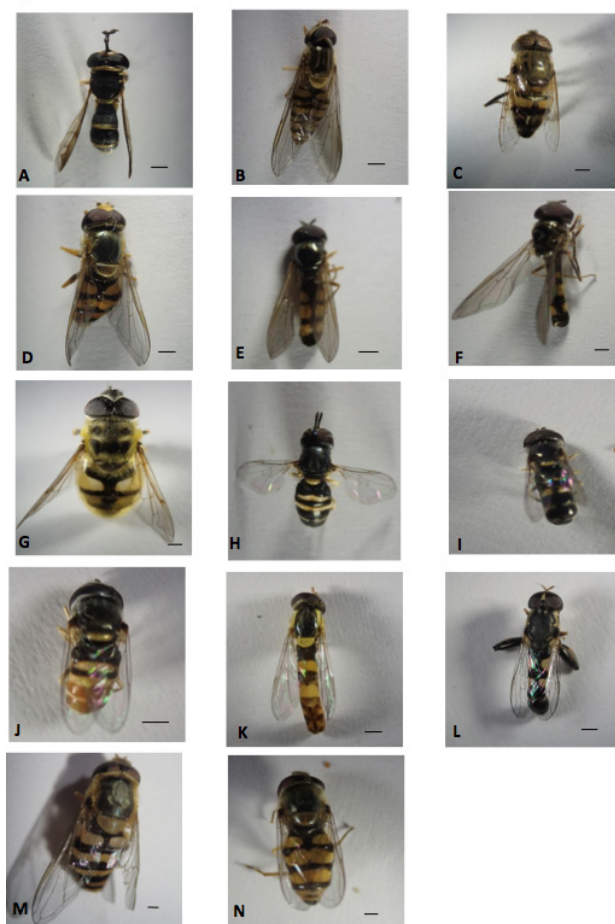
Figure 2 - Species of hoverfly found in Tapada da Ajuda (Lisbon, Portugal) between March and May 2017 in the sampled habitats: (A) - Ceriana vespiformis (Latreille); (B) - Episyrphus balteatus (De Geer); (C) - Eristalinus taeniops (Wiedemann); (D) - Eupeodes corollae (Fab.); (E) - Melanostoma mellinum (L.); (F) - Melanostoma scalare (Fab.); (G) - Myathropa florea (L.); (H, I, J) - Paragus quadrfasciatus Meigen; (K) - Sphaerophoria scripta (L.); (L) - Syrirta pipiens (L.); (M) - Syrphus ribesii (L.); and (N) - Syrphus vitripennis Meigen (bar – 1 mm).

(De Geer) was the most abundant (16 in 64 – 25%), although Sphaerophoria sp. was dominant in the olive and the plum orchards and in the Apiaceae field (Table 1). Sampling dates with higher number of adults captured were 17 th March, 20-21 th April and 18 th May. The small field of Apiaceae was the habitat with higher specific richness even though it was sampled only in the last fortnight of this study. Simpson's and equitability indexes were similar in olive orchard and Apiaceae field, and higher and lower, respectively, than in the plum orchard; in Lagoa Branca, the habitat with lower hoverfly diversity Simpson's index was the highest (Table 1).