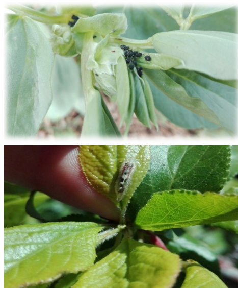
Figure 3 - Hoverfly larvae in aphid colonies in fava bean plants (A) and plum trees (B).

In the plum orchard 15 larvae/pupae were observed in aphid colonies collected in fava (Figure 3) plants to feed the hoverflies immatures in laboratory. Seven hoverfly adults emerged as mentioned before, two pupae died, and six larvae /pupae were parasitized. E. balteatus , S. scripta , Syrphus vitripennis Meigen, S. ribesii and Melanostoma mellinum (L.) were identified from this material. From one of the parasitized pupae gregarious larval-pupal Pteromalidae (Hymenoptera: Chalcidoidea) parasitoids emerged and from the other five pupae we obtained solitary parasitoids of the subfamily Diplazontinae (Hymenoptera: Ichneumonidae: Ichneumonidae) (Figure 4).