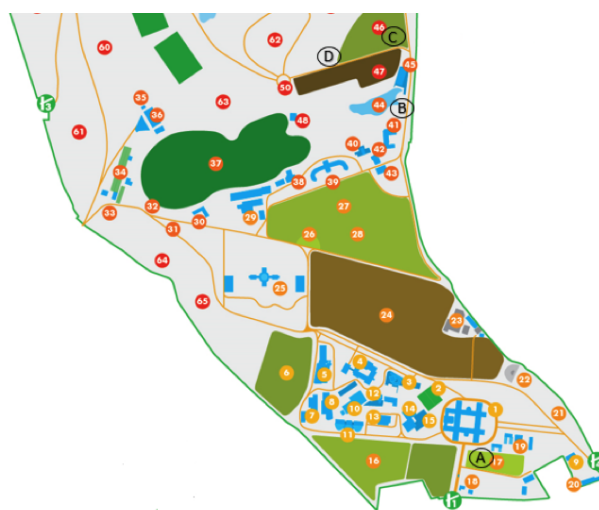
Figure 1 - Habitats sampled for hoverfly prospection in Tapada da Ajuda (38°42'27.5"N; 9°10'56.3"W, Lisbon, Portugal): A - plum orchard; B - herbaceous vegetation near Lagoa Branca; C - Apiaceae small field; D - olive orchard (adapted from http://www.isa.ulisboa.pt/files/site/pub/mapa_tapadadaajuda_2014.jpg ).

Sampling was performed weekly from 16 th March to 31 th May 2017. Hoverflies were collected in different habitats in Tapada da Ajuda: olive orchard, plum orchard where Vicia faba L. was sown between lines, adventitious herbaceous vegetation mainly Asteraceae species near Lagoa Branca, and, in the last fortnight of the study period, an Apiaceae small field at the opposite side of the olive orchard road (Figure 1). Adults were collected in all habitats, mainly with entomological net, but also with plastic vials and plastic sacs. In the plum orchard, immatures (eggs, larvae and pupae) were also collected in aphid colonies on fava bean plants and plum trees, from 30 th March to 18 th May. Sampling of immature hoverflies was performed observing 8 or 10 fava plants/inter-row, randomly chosen, in 8 inter-rows (total: 48 and 80 plants), and 3 or 5 plum trees/row, in 5 and 4 rows, respectively (total: 35 trees).