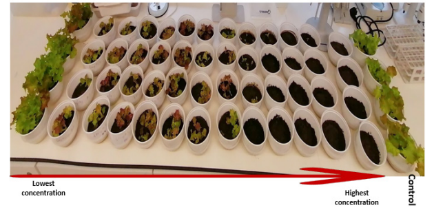
Figure 1 - Phytotoxicity of As to L. sativa.

shown in Figure 2. The NOEC and LOEC values recorded were 1.86 mg As kg^{-1} \operatorname{soil}_{dw} and 3.35 mg As kg^{-1} \operatorname{soil}_{dw} and 5.68mg As kg^{-1} \operatorname{soil}_{dw} and 9.95mg As kg^{-1} \operatorname{soil}_{dw'} respectively, for these organisms.