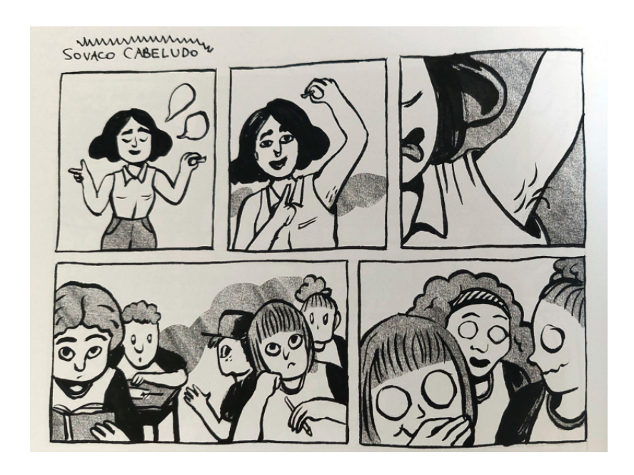
Figure 8. "Hairy Armpit"