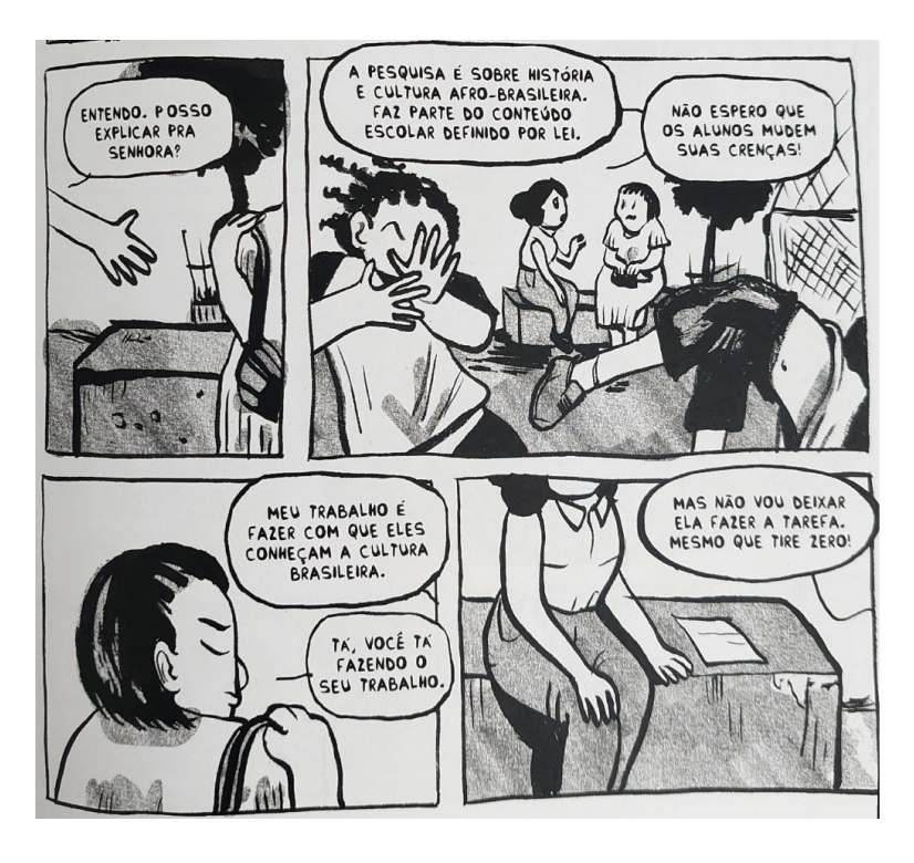
Figure 7. Scene of the mother of a student criticizing the assignment on the film Besouro Source. Taken from "Besouro", by A. Lemos, 2021, in A. Lemos, Fessora!, p. 49. Copyright 2021 by Aline Lemos.

Brasileiro, evidences the effort to "erase the memory of the African" (p. 84) and among the different social groups and individuals that aided in this project of the dominant ideology were historians, social scientists, literati and educators. The culture of the white man and European was desirable and emphasized in the official history of Brazil, and reflected in the school curriculum. This law seeks to break the continuity of the historical silencing of subordinated peoples in Brazil, but there is resistance to its implementation in everyday school life. This is clear when Aline presents the visit of a mother who questions the homework on the history of black people from the film Besouro (Figure 7): "my daughter isn't going to do that assignment! And you shouldn't teach those things!" (p. 49).