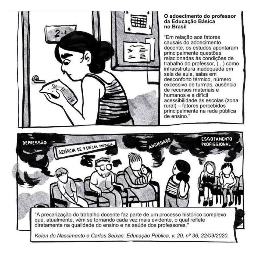
Figure 3. Comic story "Licença"