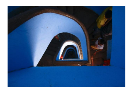
Figure 4 Holiday Building stairs