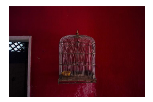
Figure 22 Cage in a red painted wall in one of the apartments

Still, a collage on the wall (Figure 23), made with newspaper and magazine clippings, gathering phrases, texts, and images of movies and international celebrities, suggest that its creator, of a young profile, was quite identified with the pop culture, music and American cinema, symbols of a modern and globalised lifestyle.