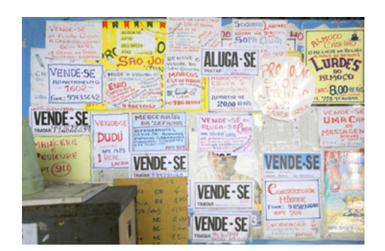
Figure 10 Wall with notices on Holiday

The Holiday residents appear to share a look of weariness and hope. Brown skins, ageing adults, and a distressing uncertainty about the future of the investment of money, time and lifestyle called Holiday. The men, portrayed on an ordinary day, are dressed less casually — shoes, long trousers, striped polo shirt, suggesting that they are engaged in work activities outside the microcosm of the large building (Figure 11).