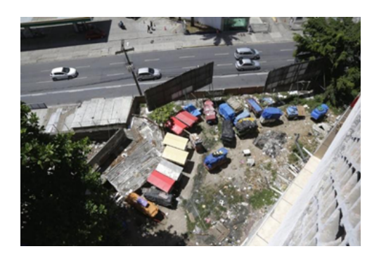
Figure 6 The ground floor of the building

Wagons parked on the ground floor of the building, next to an accumulation of debris that suggests abandonment, belong to beach hawkers who live in the Holiday or use it as a supporting point (Figure 6).