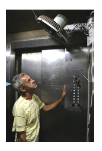
Figure 12 The Holiday Building's elevator