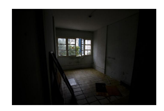
Figure 17 Holiday vacancy