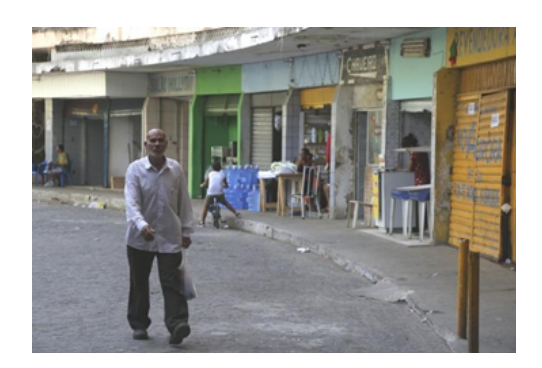
Figure 7 Man walks in front of the stores that are in the building

The ground floor shops of the building, characterised by the supply and demand of low-cost products and services (Figure 7, Figure 8 and Figure 9), constitute a place of circulation and exchange of economic and social capital in a space appropriated by agents of popular lifestyles.