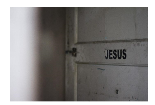
Figure 18 Door of one of the apartments