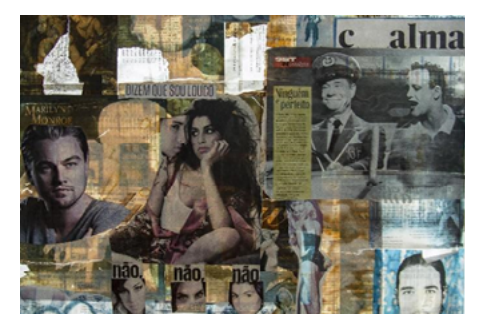
Figure 23 Wall collage in one of the apartments

We see from the images that a resident of the Holiday no longer holds the same efficacy of distinction, comparable to the moment of its inauguration. In its formal aspect, the modern aesthetic provisions of the development, pretentiously associated with good taste, high standards and quality of life, quickly lost their legitimacy and recognition among the dominant classes of Recife. The lifestyle that the project sought to disseminate, associated with a minimum housing model and a more collective way of living, did not confer on the first residents the desired sense of distinction and selectivity. Without recognising refinement and validation before the local elite, whose taste was still very much linked to an "aristocratic" and "sugar" habitus , the Holiday saw its trajectory take place through an intense symbolic degradation.