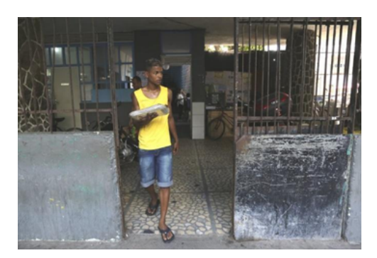
Figure 9 Morador atravessa o portão de entrada do Holiday