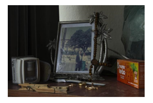
Figure 19 Belongings left in the apartment