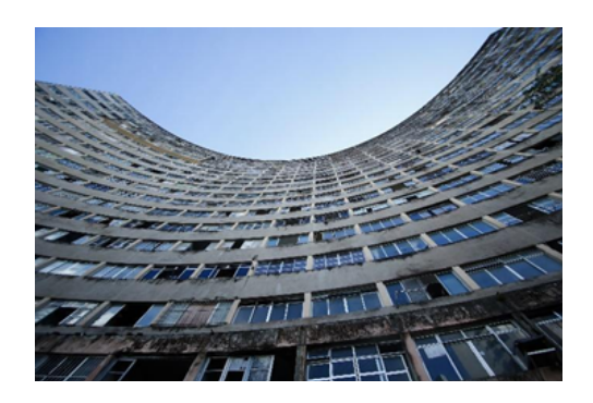
Figure 3 Holiday Building facade Source. From "Inventário" (Revista Trama), by Marlon Diego, 2019 (https://tramabodoque.com/2020/08/23/ inventario/). Copyright 2019 by Marlon Diego. Reprinted with permission of Marlon Diego.

If looking closely, it is possible to understand the grandeur of one of the most iconic buildings in Recife (Figure 3 and Figure 4).