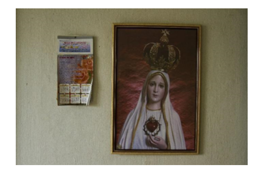
Figure 20 Pictures on the wall of one of the apartments