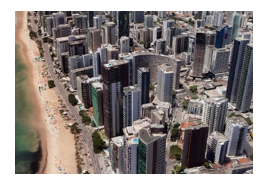
Figure 2 Holiday Building in 2019 Credits. Google Maps. © 2019 Google

Source . From Recife de Antigamente, by Jorge Moura, 2020, Facebook (https://www.facebook.com/recantigo/photos/pcb.2959346344205896/2959346230872574)