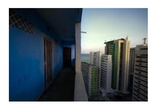
Figure 5 Holiday Building neighborhood

Its shape, with its own characteristics, occupying an entire block diagonally, its multiple side accesses, its expressive sinuosity, in 18 floors with almost countless windows, the Holiday Building dominates the landscape of the surrounding waterfront, in a section of Boa Viagem, having become an important landmark. As if its aesthetic properties were not enough to make it stand out from the other high-standard residential buildings in the neighbourhood (Figure 5), the social uses of the Holiday — associated with classes of low social prestige and economic power — place it in an inconvenient position in the social space of the neighbourhood.