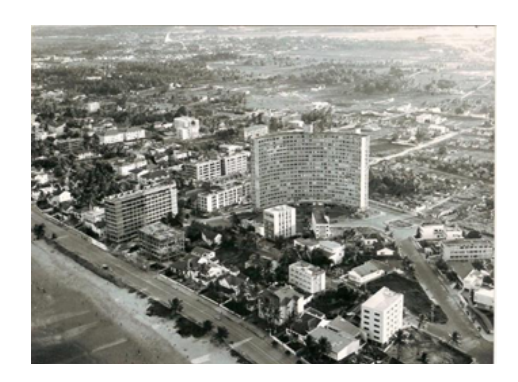
Figure 1 Holiday Building in 1967

The Holiday was built in 1957, and its design was signed by the engineer Joaquim de Almeida Marques Rodrigues (Docomomo_Brasil — Núcleo Pernambuco, 2016, p. 146). Despite some uncertainties about the true authorship of the project, it is clear its design was strongly influenced by the modern, international architecture, in the model of the Housing Unit of Marseille, an iconic multi-family building designed by Le Corbusier, with small units arranged in a vertical blade, making it possible to enjoy the seascape. In Recife, the Holiday has 18 floors, accommodating 416 small dwellings, with a capacity of lodging more than 3,000 residents. The building helped consolidate Boa Viagem as a residential, commercial, and service district, for until then, it had been an important summer holiday destination in the city (Figure 1 and Figure 2).