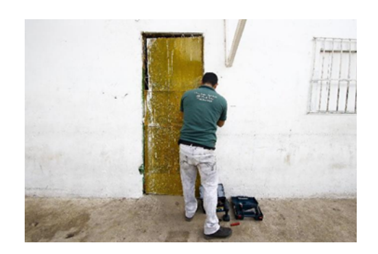
Figure 16 Locksmith opening the door of one of the apartments

space the agent needs to travel to conquer its position in the social order. However, in March 2019, the advanced structural deterioration of the building obliged the Court of Justice of Pernambuco to request its immediate interdiction. Within days, the more than 3,000 residents left the flats. Unable to remove part of their personal belongings, many residents left them behind. However, the eviction order demanded the removal of even the residents' personal belongings, and, in the same month, city hall agents went to do the "cleaning" (Figure 16 and Figure 17).