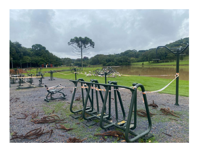
Figure 2 São Lourenço Park (Curitiba/Paraná/Brazil), in May 2020. Under red flag (high risk of COVID-19 contagion)