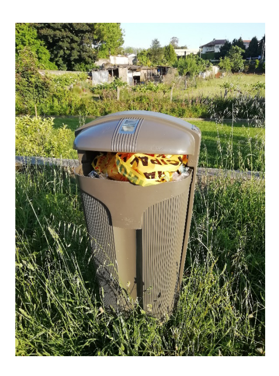
Figure 7 Maia ecotrail, May 17, in a post-state of emergency period and under the state of calamity Credits. Fernanda de Castro and Maria Manuel Baptista