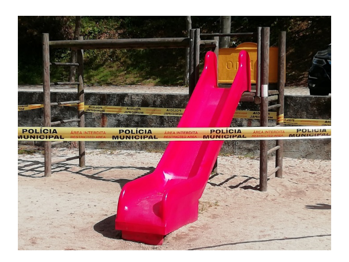
Figure 3 Maia ecotrail, March 16, 2020, under the state of emergency (first general confinement)

For Foucault (1994/2006), power emerges through discourses: "power is something that operates through discourse, since discourse itself is an element in a strategic device of power relations" and "establishes and regulates what can be said in certain social and cultural conditions" (pp. 253–254), but also the authority of who can speak. During the pandemic, the body was and continues to be regulated and disciplined by hygienic and disciplinary guidelines, measures and decrees produced by the government with the help and advice of technology (Deleuze, 1992; Haraway, 2018; Haraway et al., 1985/2009) which, at the same time it contains and protects "some" bodies, also imprisons it in the name of collective health and welfare, following a biopolitical management (Foucault, 1979/1998, 1996/1999, 1975/2002, 1994/2006): respiratory etiquette, recurrent hand washing following a timed ritual, the preference for spaces with little movement of people (Direção-Geral da Saúde, 2020b); the mandatory or prophylactic reclusion or confinement of bodies, especially the most fragile and elderly, the practice of social distancing, the successive renewals of the state of emergency in order to mitigate the transmission of the disease and the ultimate goal of containing the spread of the virus (Decreto-Lei n.º 20-A/2020, 2020; (Figure 3 and Figure 4).