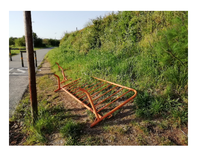
Figure 11 Maia ecotrail, April 27, 2020, under the state of emergency (first general confinement)

and vital importance to leisure in a relevant political and performative praxis (Baptista, 2016; Figure 11 and Figure 12).