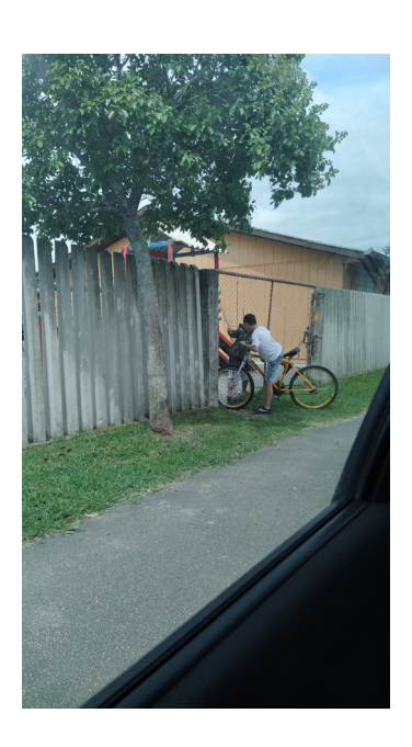
Figure 10 Children entering a closed school in Tatuquara Neighbourhood (Curitiba) to play, October 2020

These images portray a very sneaky and creative disobedience to the prohibitions and social norms, which break with imposed barriers (Certeau, 1993/1995). Despite incurring the crime of disobedience within the dynamics of discipline and punishment , the (dis)obedient, docile, domesticated, and medicalized bodies (Foucault, 1979/1998, 1976/2010b) did exercise, walks, or nature contemplation into political resistance. For these subjects, all subterfuges are valid to circumvent the law and make the exception rule, including individuals eager for movement who simply walk on a leash, rent, or borrow animals for hygienic walks (Dias, 2021).