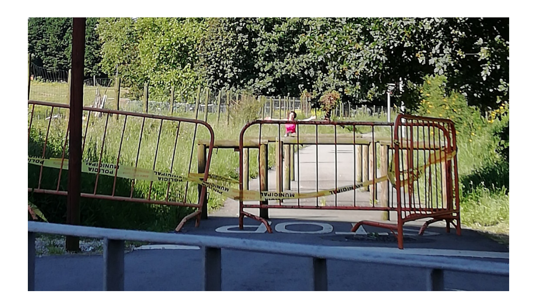
Figure 5 Maia ecotrail, March 17, 2020, in a post-state of emergency and under the state of calamity