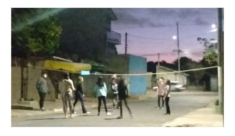
Figure 12 Teenagers playing volleyball on the street in Tatuquara Neighbourhood (Curitiba), March 2021, under the red flag (high risk of COVID-19 contagion)