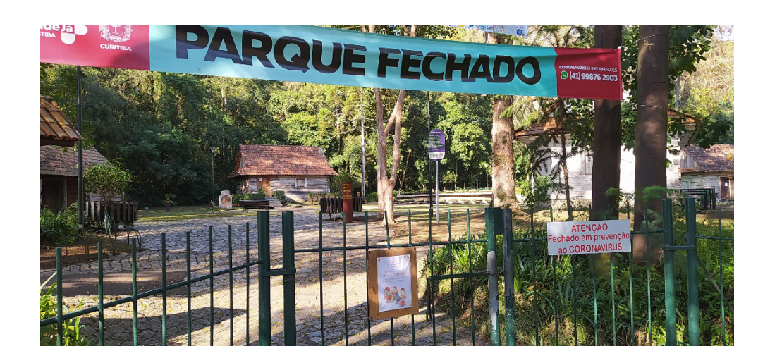
Figure 4 Bosque do Papa (Curitiba), July 2020, orange flag (medium risk of COVID-19 contagion)

In Curitiba, faced with the worsening of COVID-19 and the impending lack of beds in the healthcare network, the Curitiba Prefecture extended the restrictions on activities in the capital: only essential activities such as supermarkets, bakeries, and gas stations continued to operate, with restricted hours and a requirement to comply with the Health and Social Responsibility Protocol; under a red flag on the alert level, activities in the city parks were vetoed and suspended, as well as classes in the education system; consumption of alcoholic beverages was forbidden in public spaces (Decreto N.° 565, 2021).