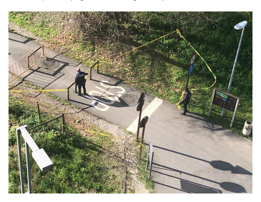
Figure 9 Maia ecotrail, February 14, 2021, under the state of emergency (second general confinement)

Although disregard of measures would result in incurring the crime of disobedience, the fact is that, for several days, we saw insubordinate bodies with a subversive potential, a month after the state of emergency was declared, particularly in April and May. They resisted the order and reconquered, reappropriated, and reterritorialized themselves (Deleuze & Guattari, 1980/1997) in the public space, often violently challenging the discipline imposed on their bodies (Foucault, 1979/1998, 1976/2010b). We even witnessed the Sisyphean intervention of the authorities, that closed ecotrails, parks, and gardens daily and continuously in an attempt to control the possible agents of disease transmission that yearn for mobility and the return to a supposed "normality" and, therefore, defy the state and the order imposed (Figure 9 and Figure 10).