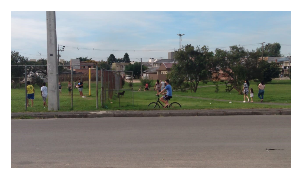
Figure 6 Square in Tatuquara Neighbourhood (Curitiba), March 2020, under the red flag (high risk of COVID-19 contagion)

In fact, in the pre-pandemic period, we often heard reports about the high dependence on technology among young people, the excessive time spent by children on video games and the computer, the social interactions in cafes and restaurants where both the children and adults spent most of the time in silence, staring at mobile phones or tablets screens, on a broken and technologically mediated face-to-face communication.