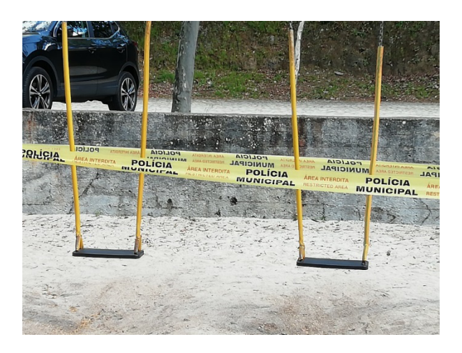
Figure 1 Maia ecotrail (Portugal), March 16, 2020, in a period pre-state of emergency (first general confinement)

Free time allows individuals to regain their energies so that, in a moment, the machine-man/body, intensively exploited and tamed (Foucault, 1976/2010b; Lafargue, 1977/2011), may return to production and that, in this fraction of time, may he spend the fruit of his labor, which is even a benefit of the system. The COVID-19 pandemic and the associated regulatory confinement led to the suppression of leisure habits and dynamics that reinvigorated individuals from their physical and intellectual effort, oppressing them, as if since they do not have work or do not find themselves in the usual conditions for production in the market context, they had no right to leisure (Figure 1 and Figure 2).