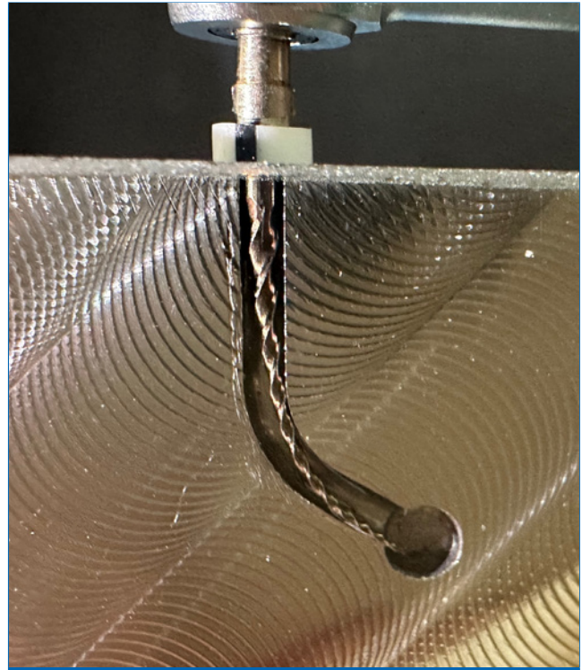
Figure 1. Test model in a stainless-steel block with an internal diameter of 1.5 mm, an angle of curvature of 60°, and a radius of curvature of 5 mm.

All files were collected in safe-lock tubes with broken tips to take scanning electron microscopy (SEM) images. SEM was