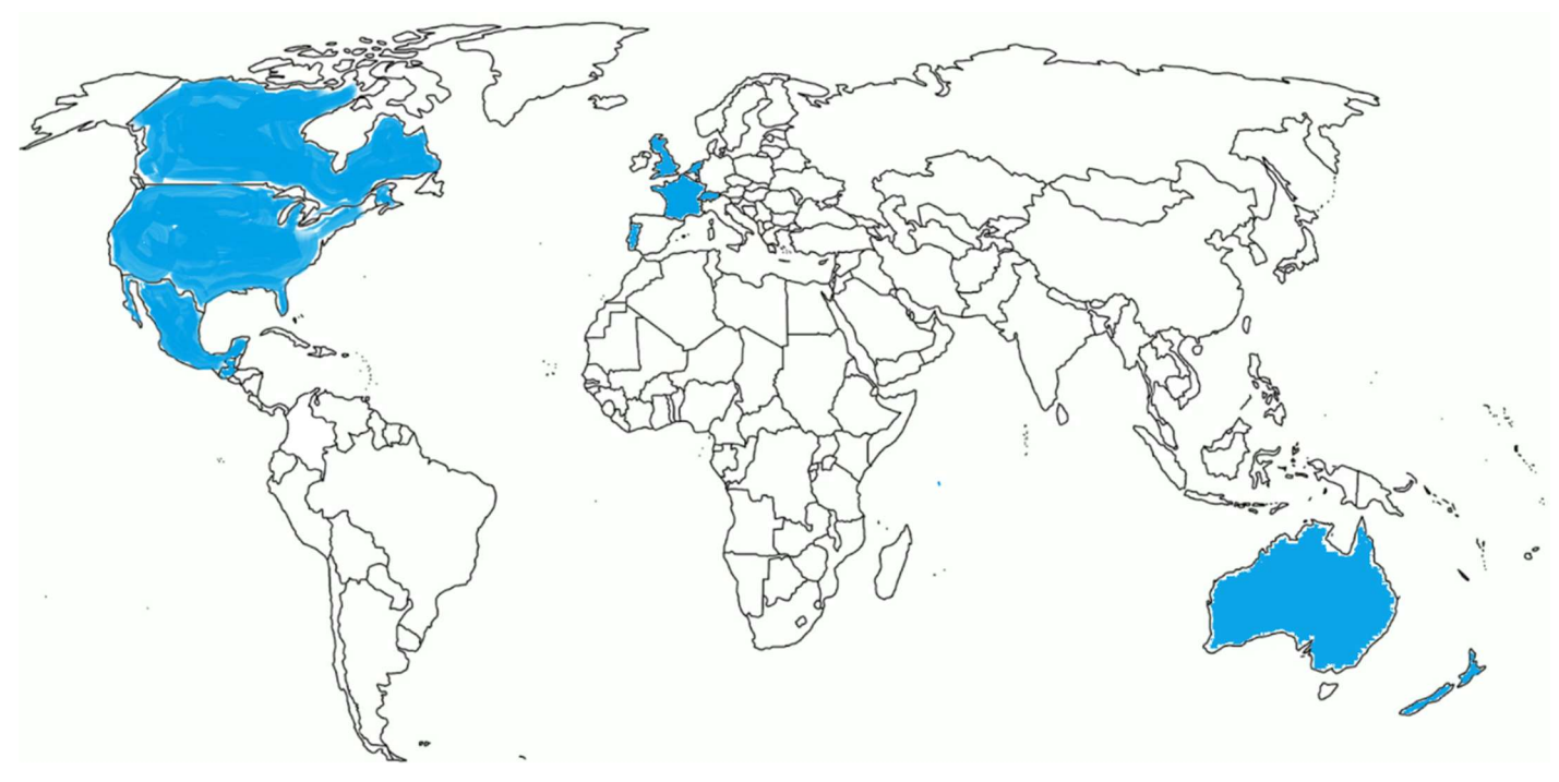
Figure 2 - World map showing which countries * have rehabilitation nursing as a specialty.

have rehabilitation nursing as a legally recognized profession, as shown in the map below.