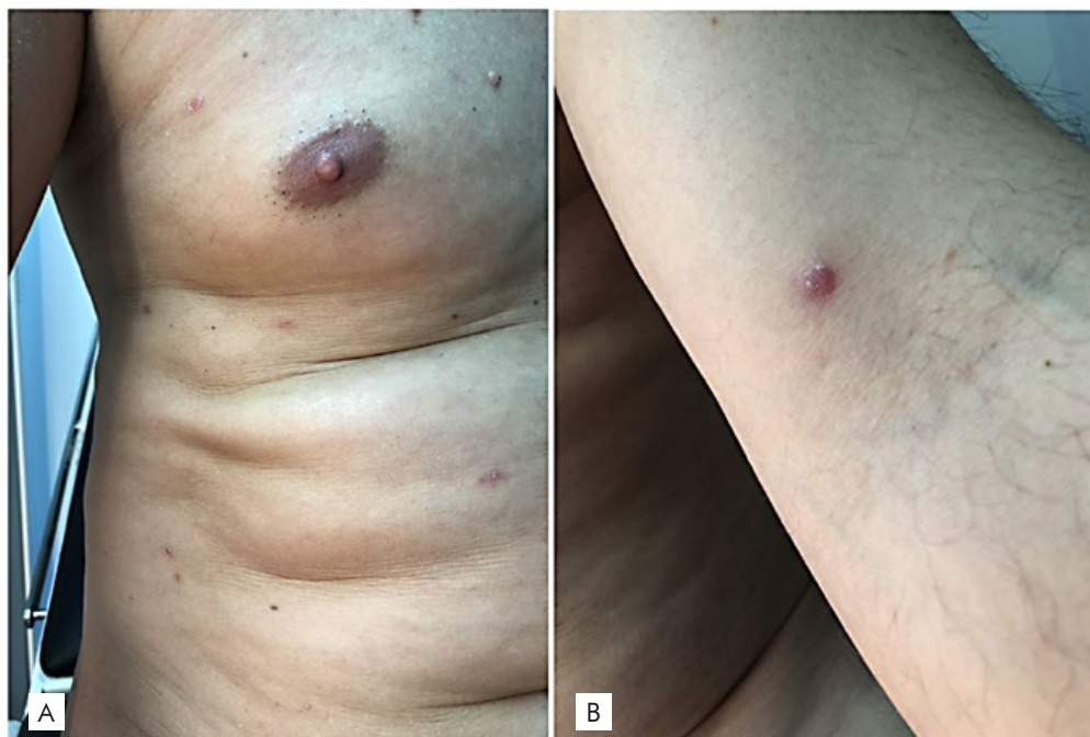
Figure 2 - Multiple isolated erythematous papules and nodules on the trunk (A) and left arm (B).

This case reports a patient with syphilis reinfection presenting as a syphilitic balanitis of Follmann and syphilides on the trunk and limbs and a negative VDRL as a “prozone phenomenon”. The patient had a past history of syphilis, so a reactive TPPA test was expected. Actually, treponemal tests fail to distinguish treated syphilis from active/latent syphilis.