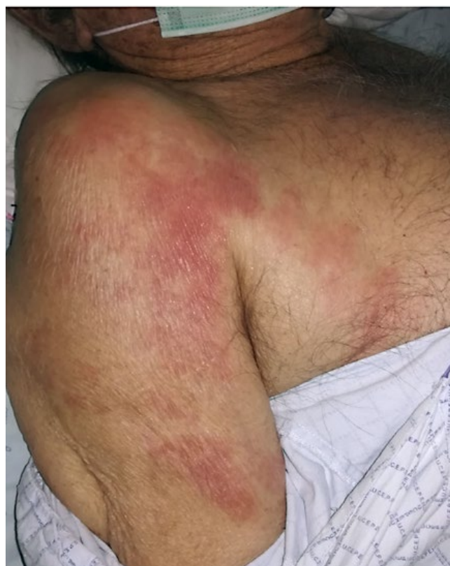
Figure 1 - Maculopapular rash in the right axillary region.

Nevertheless, on day 7 of hospitalization, with no associated respiratory distress or other relevant systemic symptoms, he developed a non-pruritic symmetric maculopapular rash on the trunk and arms, next to axillary folds, with red confluent erythematous lesions that extended to the shoulder and flexures. On the following day, cutaneous lesions progressed to the cervical region and upper trunk (Fig. 1), subsequently stabilizing until resolution within 7 days of onset. Lower limbs, face, palmoplantar regions and mucous membranes were spared. Concomitantly, a second SARS-CoV-2 nasopharyngeal swab was positive and there was a slight increase of inflammatory serum parameters,