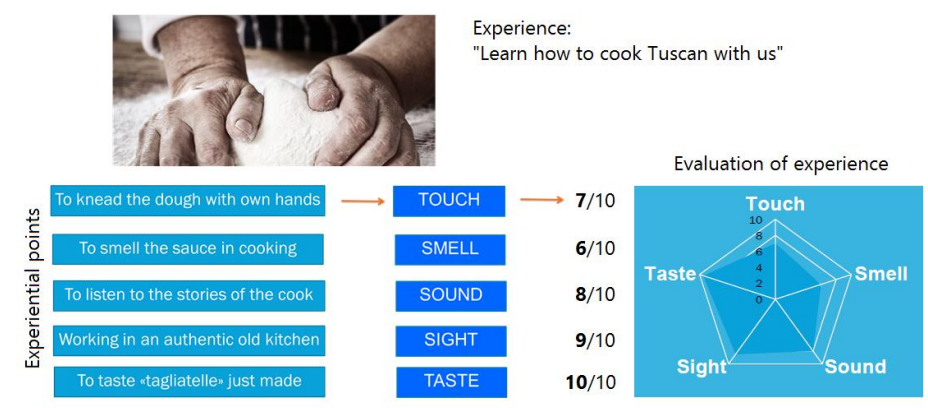
Figure 3 - The application of the senses-based model to the youtooscany.com experience 'Learn how to cook Tuscan with us'

construction/improvement) of this scenario and perspective at a specific and precise level.