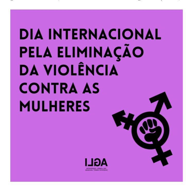
Figure 6: Instagram post @ilgaportugal

debate on gendered bodies, desexualised models and gender (Lessa, 2015).