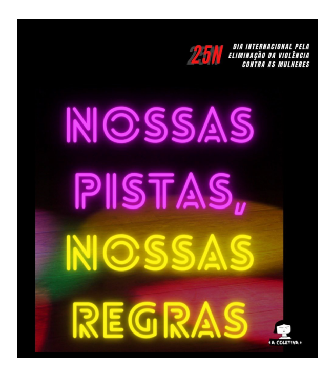
Figure 5: Instagram post @a_coletiva_feminismos Notes. Translation "our dance floors, our rules"

The image shows words in capital letters and extremely bright colours reminiscent of nightclub neon lights, which is further supported by the use of the term "dance floors". The idea presented resembles the various campaigns against harassment, especially along the lines of "my body, my rules", which always makes an appearance amidst the "disorderly" words of feminist demonstrations in Portugal (Lamartine & Cerqueira, 2022).