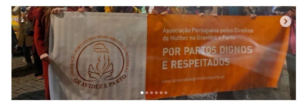
Figure 9: Instagram post @apdmgp