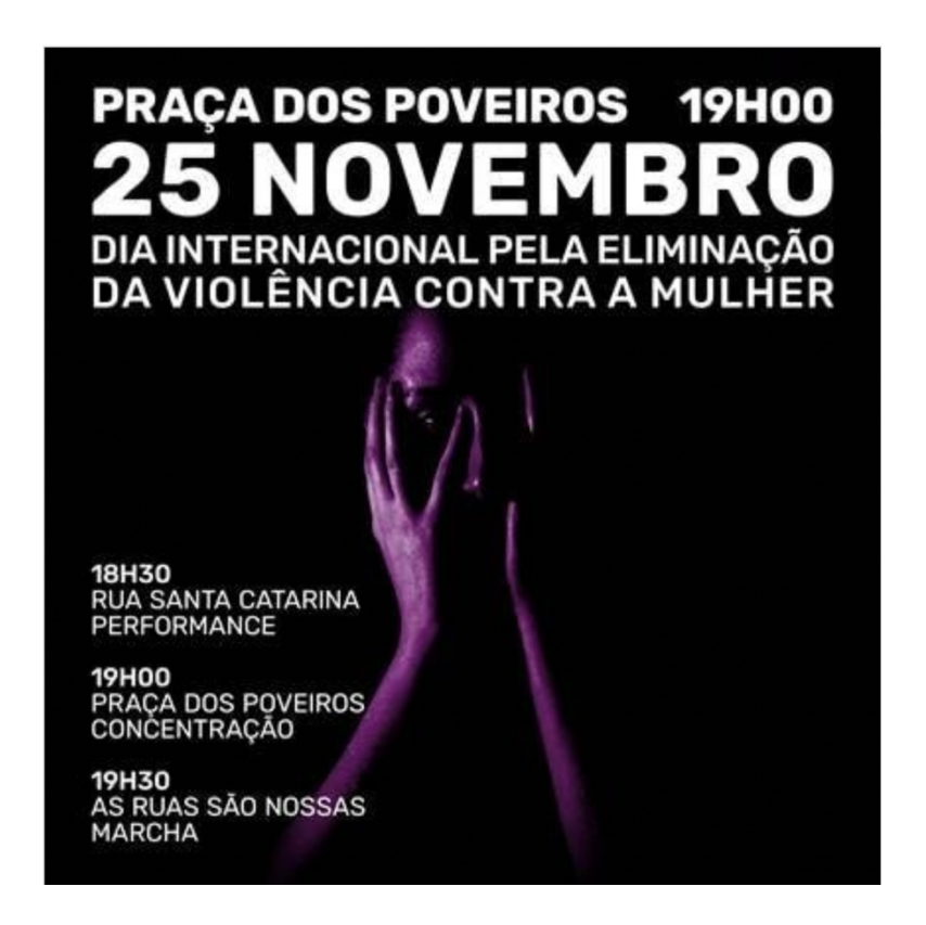
Figure 3: Instagram post @feminismossobrerodas