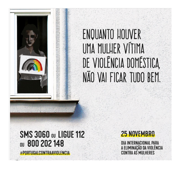
Figure 2: Instagram post @feministasemmovimento