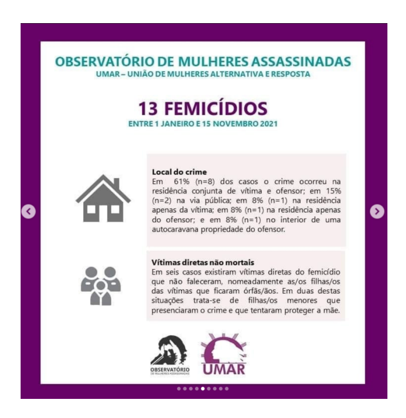
Figure 4: Instagram post @umar_feminismos