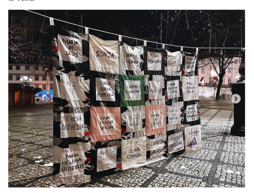
Figure 8: Instagram post @jamarchavas Source. From #jamarchavas #jamarchavas2021 #viseu #25novembro #25n #feminismo [Photo], by Plataforma Já Marchavas! [@jamarchavas], 2021, Instagram (https://www.instagram.com/p/CWtmP3FgD3O/)

For Lessa (2015), the use of a patchwork quilt provides important, commonly used imagery at the intersection between art and feminism. She also believes that there is a debate on the status of the object in art and on the distance between art and handicrafts, as the latter has historically been considered to be compulsory for women.