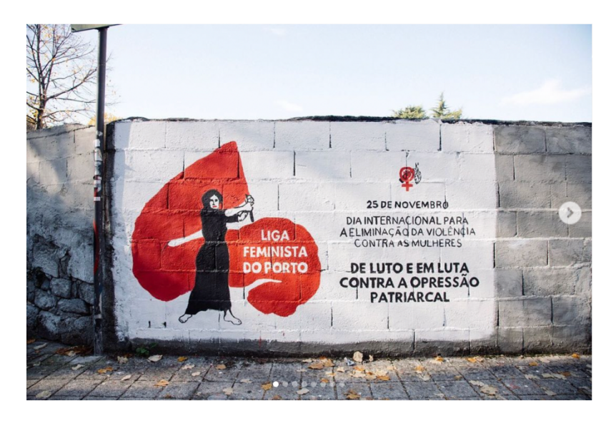
Figure 7: Instagram post @ligafeministadoporto

Notes. Translation "Porto Feminist League, 25th November: International Day for the Elimination of Violence Against Women. In mourning and struggle against patriarchal oppression"