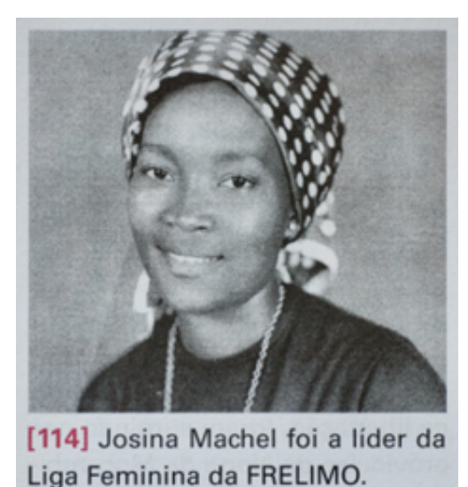
Figure 10. Josina Machel

Figure 9. Noémia de Sousa