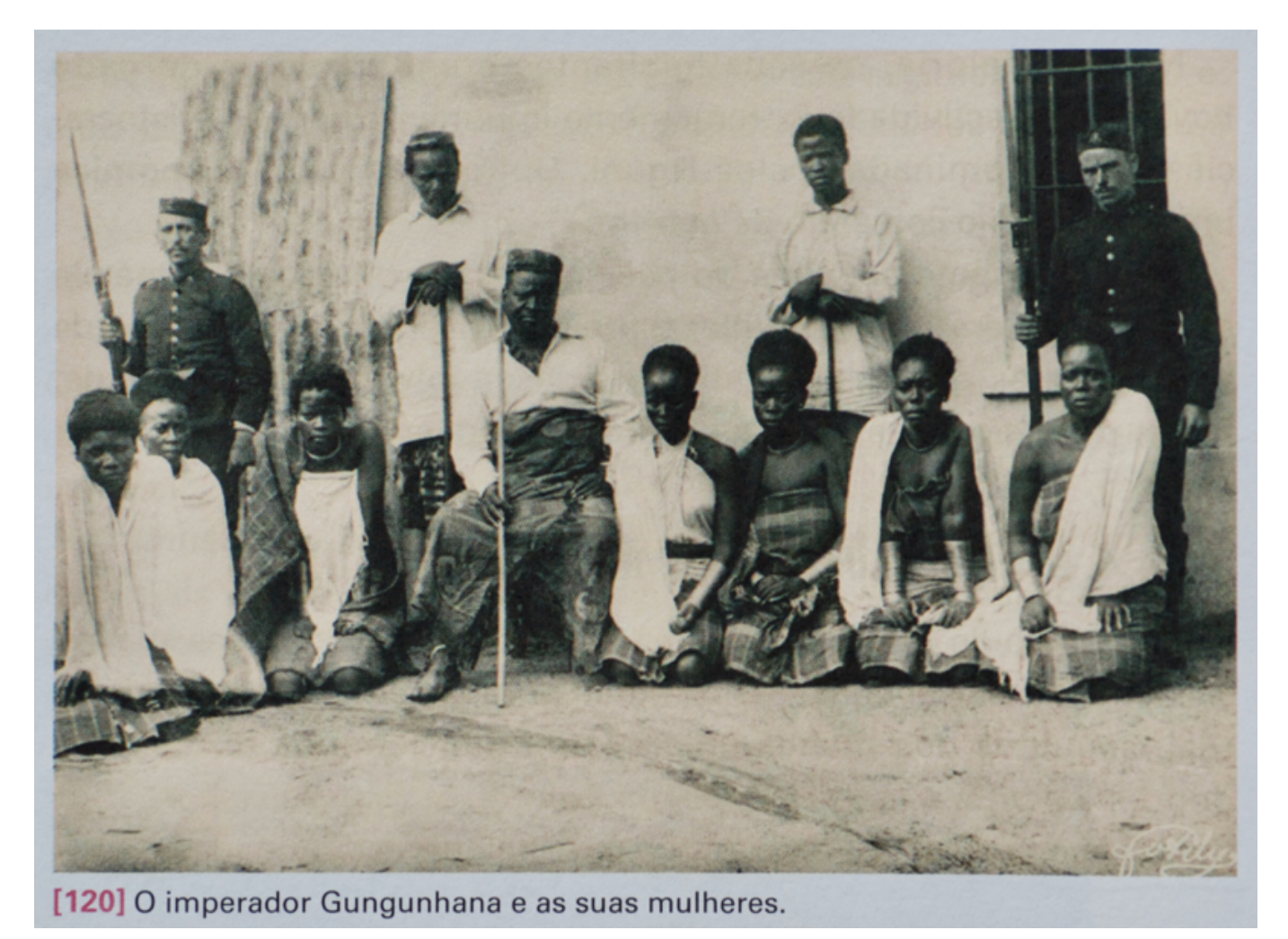
Figure 8. "Emperor Gungunhana and his wives"

Figure 8 features a photograph with the following caption:"the emperor Gungunhana and his wives" (p. 130). It depicts the emperor with the women who accompanied him upon his deportation to Lisbon, but they are not named.