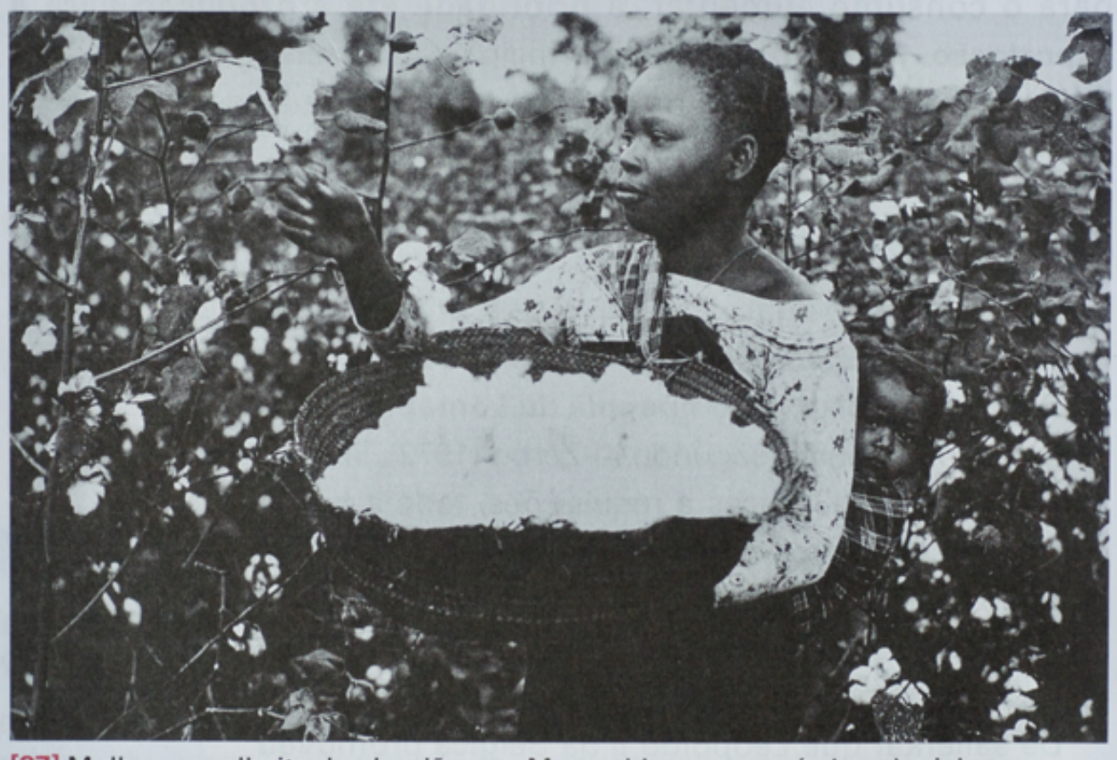
[27] Mulher na colheita do algodão, em Moçambique, no período colonial.

Figure 2. "Woman at the cotton harvest"