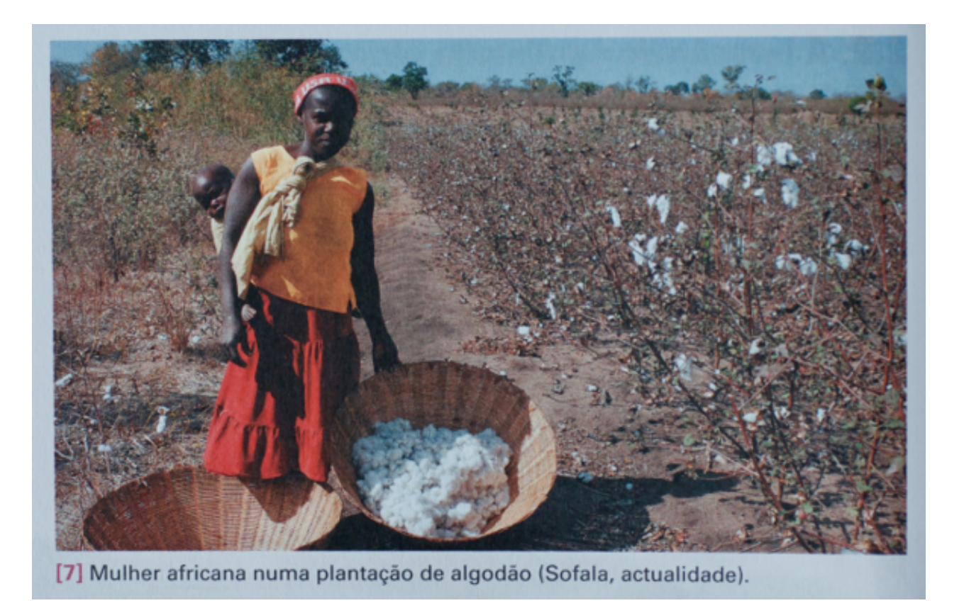
Figure 1. "African woman in a cotton plantation" Source. From História 11<sup>a</sup> classe (p. 56), by J. Nhapulo e G. Cumbe, 2015, Plural Editores. Reprinted with permission.

When addressing the slave trade, the textbook shows a photograph of a "Swahili tribal woman" (p. 76) without any further contextualisation. The text mentions that "the slave trade and its circumstances may have opened up a new relationship between local tribes and Europeans" (p. 76). One can infer that this photograph intends to illustrate one of these alleged "tribes".