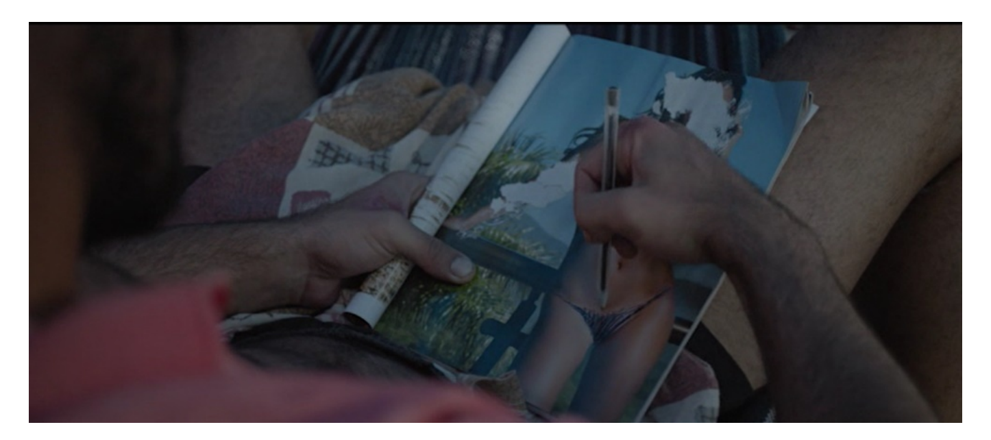
Figure 4. Drawing your wishes Source. From Boi Neon (00:26:27), by G. Mascaro, 2015. Copyright 2015 by Gabriel Mascaro.

in the popular imagination, erotic or pornographic magazines are associated with masturbation, especially common in the social universe of masculinity. The practice of onanism is historically marked by an endless number of taboos, including some medical treatizes were written with the intention of regulating the behaviors linked to the contingency of this sexual practice deviated from its functions linked to family constitution through procreation. (pp. 445-446)