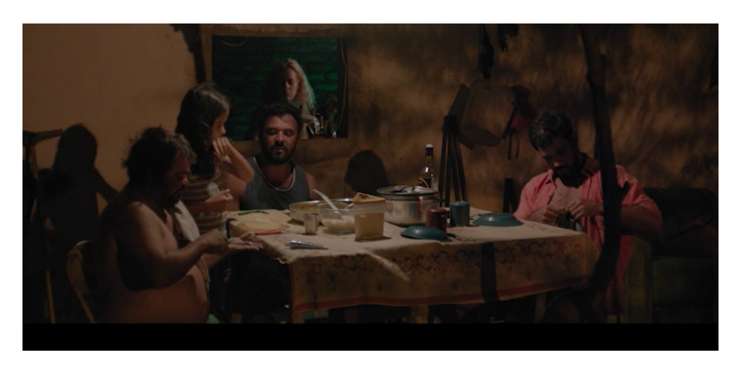
Figure 5. Alternations between the lines of masculinities

However, before we move on, I would like to emphasize that we experience our subjectivities in contingent, not rigid ways, also being foci of negotiation, of dispute. In the same scene mentioned above, when Iremar's colleague questions him because he is sewing, he replies with a homophobic outburst: "but I'm not the one who drinks and takes off my clothes, you frango ?!". There we see that for a moment, Iremar positions himself in the traits linked to hegemonic masculinities, trying to establish the greatest possible distance from homosexuality: the danger, the amazement for the maintenance of heterosexuality. To keep the heterosexual matrix intact, or rather, the coherence between gender identity and sexuality (Butler, 1990/2018), Iremar makes use of the power of language, since, in his daily social practices, we could confer to him approximations with the female or homosexual cultural universe, with the codes and the naturalized meanings for these bodies. Thus, I emphasize, along with Jeffrey Weeks (1996/2001), that "the sexual codes and identities that we take as given, inevitable, and 'natural' have often been forged in this complex process of definition and self-definition, making modern sexuality central to the way power operates in modern society" (p. 42).