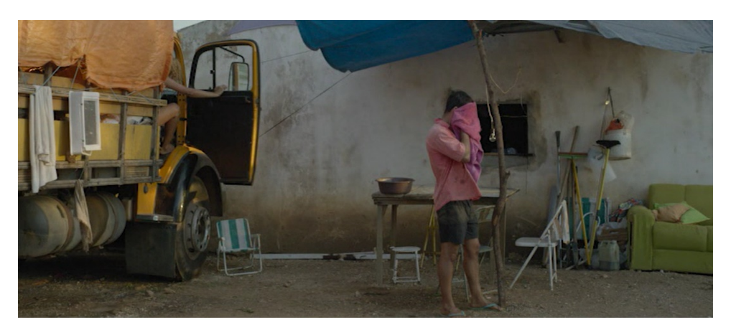
Figure 6. Boys wear pink Source. From Boi Neon (00:37:38), by G. Mascaro, 2015. Copyright 2015 by Gabriel Mascaro.