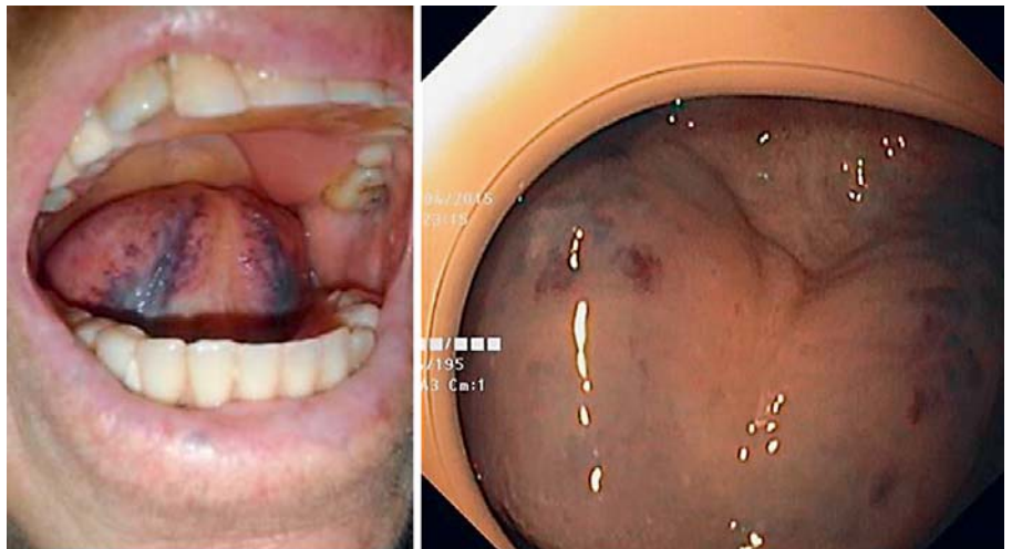
Fig. 1. Multiple purplish lesions on the lips and tongue.