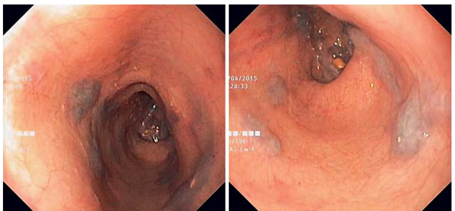
Fig. 3. Multiple purplish lesions in the esophagus.

hemangiomas, preferably in the skin and gastrointestinal tract. BRBNS should be differentiated from other syndromes that occur with cutaneous and visceral vascular malformations, like Rendu-Osler-Weber, Klippel-Tre-