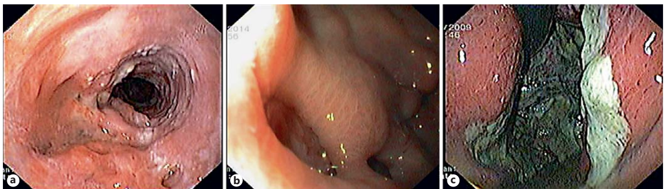
Fig. 2. Endoscopic images of upper gastrointestinal cytomegalovirus disease. a Deep esophageal ulcers (patient 4). b Deep ulcers in the gastric antrum (patient 6). c Extensive ulceration of the gastric fundus (patient 10).