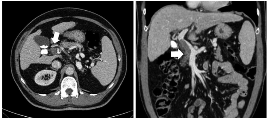
Fig. 1. Images of a thrombus occupying more than 50% of the PV trunk.

is classified as recent (<6 months) or chronic (>6 months) and a reference is made to cavernous transformation, which is associated with chronic PVT and lower probability of PVT recanalization [22]. With regard to the severity of occlusion of the main PV, degree of luminal occlusion is classified as <50% and >50%. Finally, during the follow-up, PVT should be defined as progressive, stable, or regressive [22]. All these definitions have important implications on management and outcome.