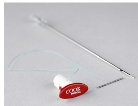
Fig. 1. Entuit Scure system (Cook Medical®).

Cefazolin was administered 30 min before the procedure. A complete colonoscopy was performed under sedation with midazolam. The patient was then mobilized into supine position, so that it was possible to identify the