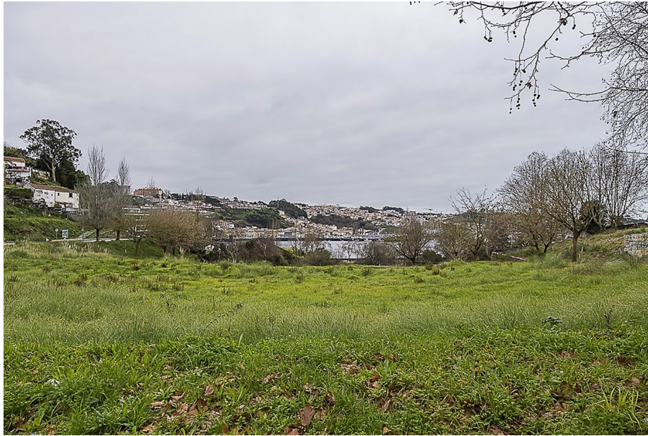
Figure 4: The location where the former Bairro do Aleixo once stood after the complex was demolished, 2022