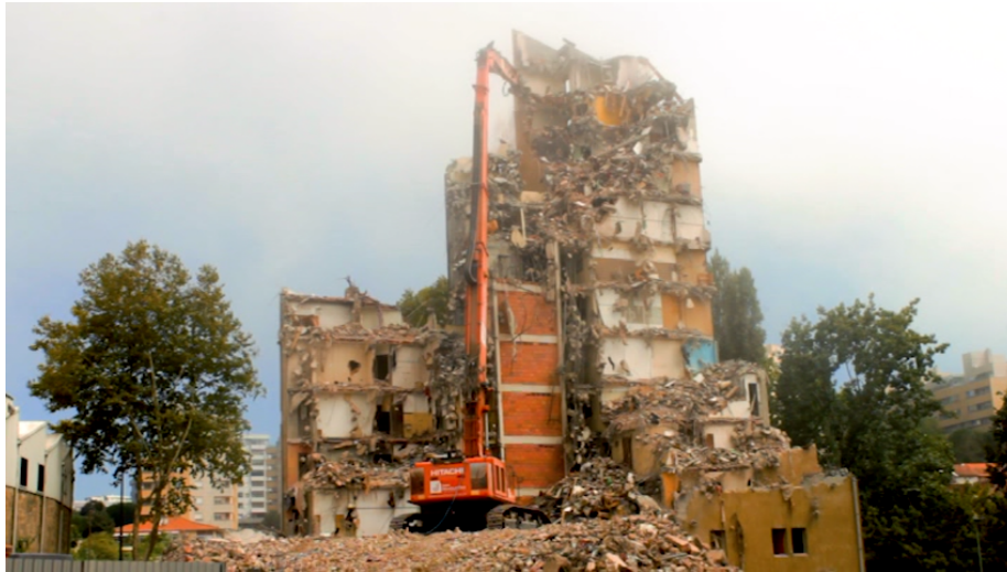
Figure 7: Demolition of Tower 2 in the Bairro do Aleixo, 2019

The processes of removal and relocation are intrinsically delicate and complex. Few things could be more traumatic than being dispossessed of your home against your will. In the case of Aleixo, perhaps because of all the stigma associated with the place, relocation proved prolonged and distressing, as documented by newspapers of the time 11 . Before the demolition, the neighbourhood was in a kind of limbo, waiting for the end, with the buildings nearly empty and more vulnerable to security risks. Neglect from municipal authorities left the remaining towers in disrepair. Malfunctioning elevators (whose operation over the years seems to have been intermittent) compounded the challenge of relocating people and their belongings 12 . It should be noted that this degradation was among the motives behind the demolition and that the failure to curb the rise in safety and health risks of the space only strengthened public support for the decision.