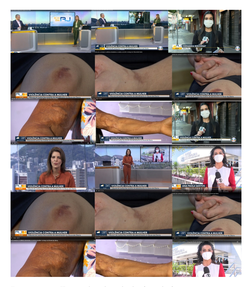
Figure 2: Taypi II: story throughout the day frame by frame Note. Prepared by the authors based on articles from August 9, 2021 (Coelho, 2021; Rouvenat, 2021).

When tallying the total number of women on screen, we identify five, only two of whom are Black: a journalist and a victim. The presence of a Black woman journalist in the lunchtime story does not, however, mean any textual changes to what is reported in the afternoon newspaper, as the same content is repeated as in the morning story. This points to the fact that the mere presence of a Black woman as the voice responsible for telling the story does not necessarily imply a narrative structured on the basis of racial power dynamics. We call