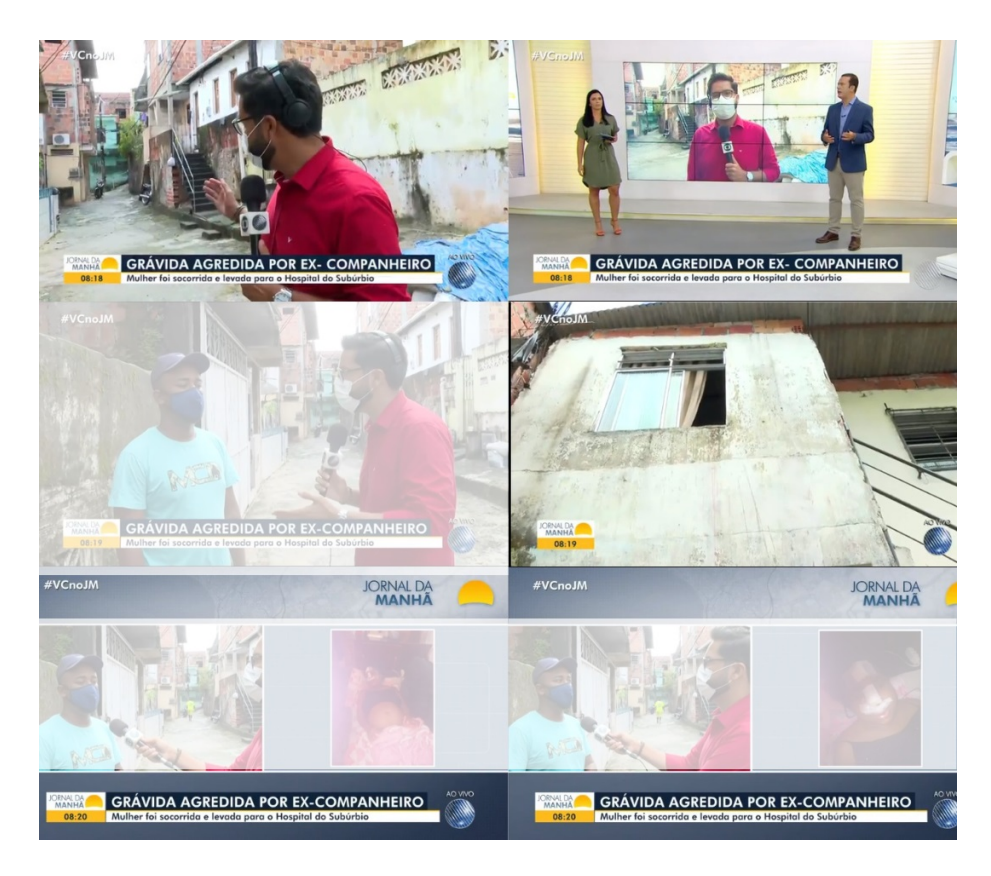
Figure 4: Taypi III: TV Bahia report broken down as an example of the exploitation of Black pain

Note. Prepared by the authors based on articles from March 7, 2021 (Bahia Meio Dia, 2022). Translation: "pregnant woman assaulted by ex-partner".