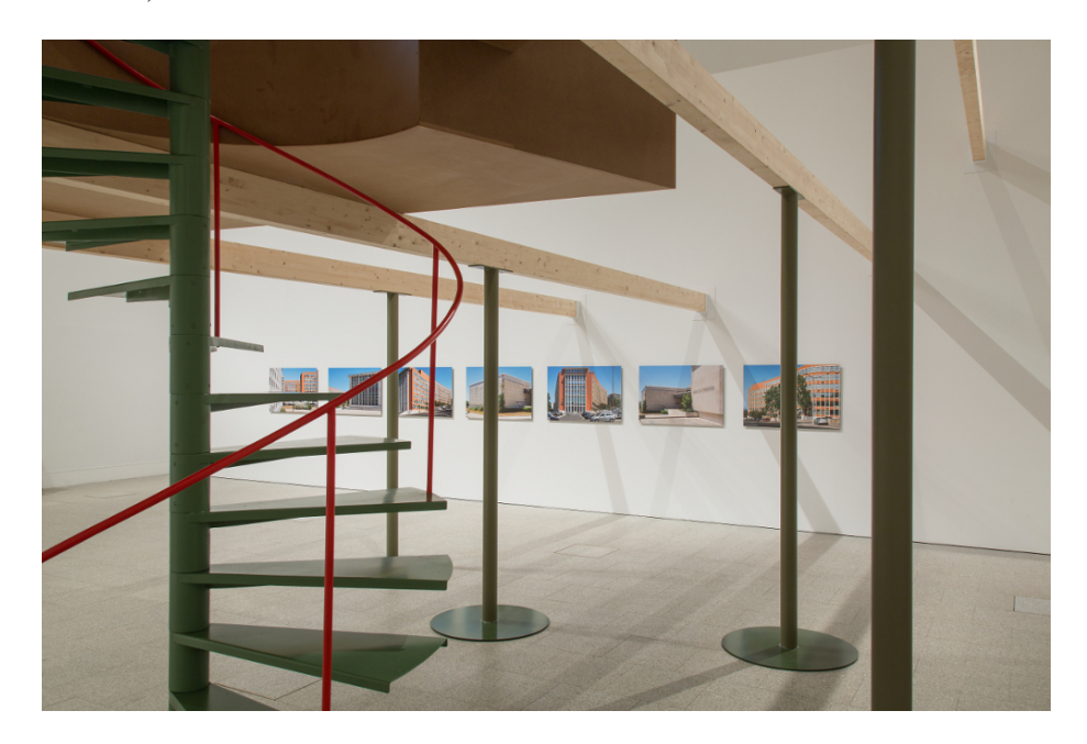
Figure 1: Detail view of the photos Source. From "A Tendency to Forget", by Ângela Ferreira, 2015. (https://angelaferreira.info/?p=249). Credits. Jorge Silva

film Adventures in Mozambique and the Portuguese Tendency to Forget<sup>4</sup> (2015, 00:19:00).