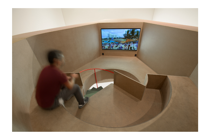
Figure 4: Detailed view of the interior of the installation (and a visitor watching the film)

Source. From "A Tendency to Forget", by Ângela Ferreira, 2015. (https://angelaferreira.info/?p=249). Credits. Jorge Silva